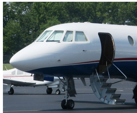
Dassault Falcon 50 Cockpit HeatShields