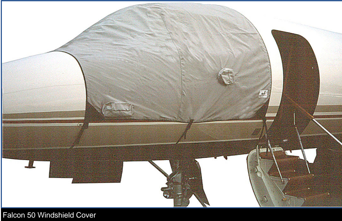
Falcon 50 Windshield Cover