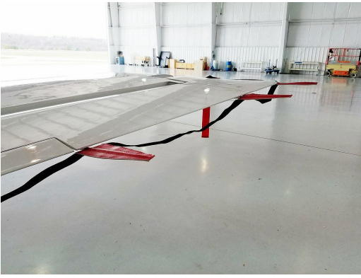
Hawker Beechcraft 800, 800XP, 850XP Static Wick Protectors