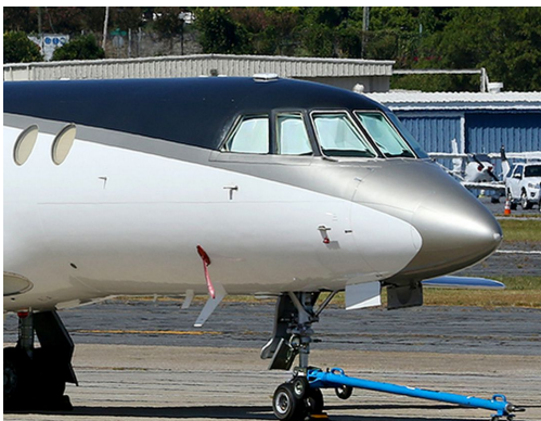
Dassault Falcon 50 Cockpit HeatShields

Cockpit Heatshields are interior sunshades for the aircraft's cockpit. The product is a unique composite of closed-cell foam with a silver mylar finish. The semi-rigid design is stiff enough to stand inside the window framing. The set folds up flat and is easily stored in the included storage sleeve. Some designs may require velcro and suction cups. Our Heatshields for jets are offered white side out because some aircraft manufacturers have issued advisories against reflective window inserts due to potential heat damage. A Heatshield is an excellent short-term remedy for cockpit overheating, but an external fabric cover is more effective for long-term protection.