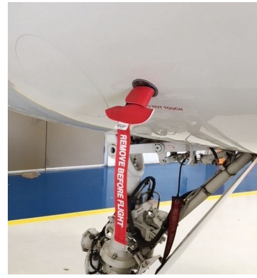
Grumman Gulfstream G-V Rosemont/TAT Cover