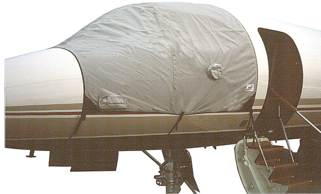
Falcon 50 Windshield Cover

This cover type is made from Silver Acrylic Sunbrella canvas and is 100% lined with a soft and smooth microfiber. Bruce's Custom Covers developed this material combination especially for aircraft protection. The outer material is medium weight and treated for water resistance, UV resistance and anti-static buildup. The inner lining is a very soft and smooth microfiber to prevent scratching. The material is very reflective, and tests show that the cabin interior temperature can be reduced to near-ambient temperature on the hottest of days. It is water, ice and snow repellent, yet breathable to allow moisture to escape from between the cover and the aircraft surface.