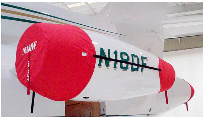
Falcon 900 Engine Cover Set