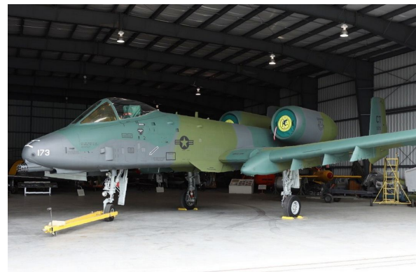
Fairchild A10 Intake Plugs, non-folding type