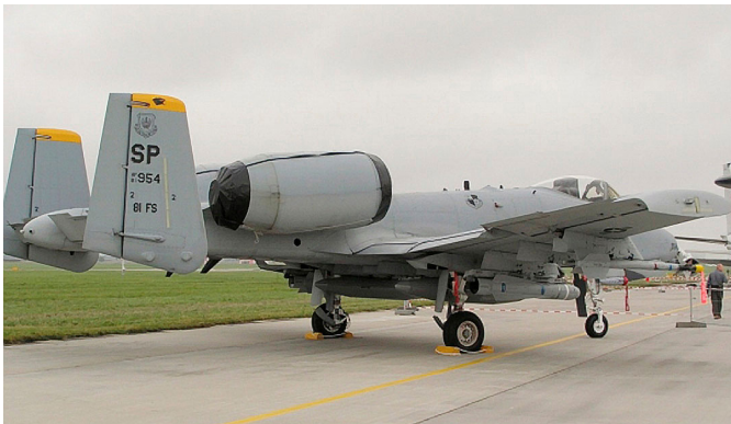
A-10 Engine Covers

ALL-YEAR USE MATERIAL - Made with Solution dyed Polyester fabric, the all-year use material is the best option for sun protection and cover longevity. This heavier more durable material is intended for all weather conditions, such as rain and snow or lots of sun.