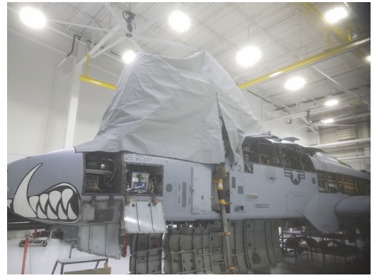
Fairchild A-10 Canopy Cover, open position