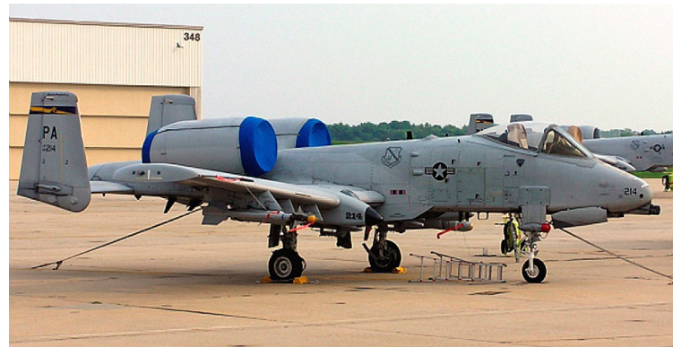
A-10 Engine Covers