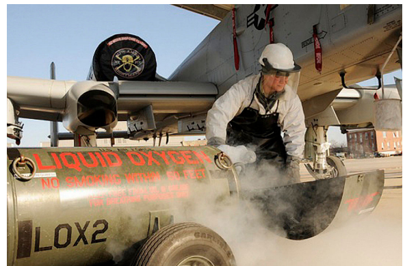
A-10 Engine Intake Cover