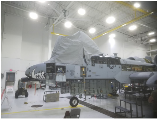
Fairchild A-10 Canopy Cover, open position