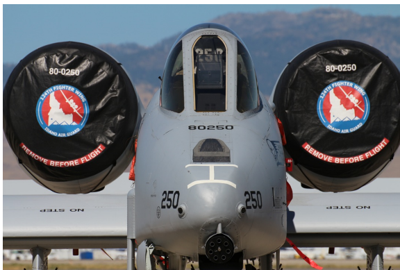
A-10 Engine Covers

ALL-YEAR USE MATERIAL - Made with Solution dyed Polyester fabric, the all-year use material is the best option for sun protection and cover longevity. This heavier more durable material is intended for all weather conditions, such as rain and snow or lots of sun.