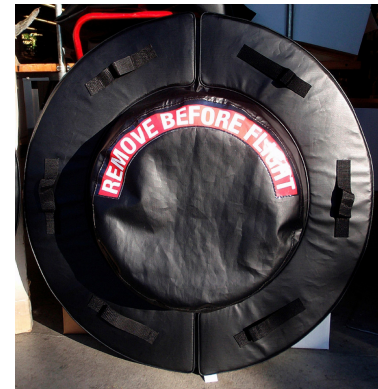
A-10 Exhaust Plug/Cover