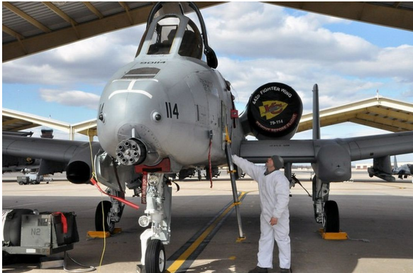
Fairchild A10 Intake Covers & Nose Gun Scoop Plug