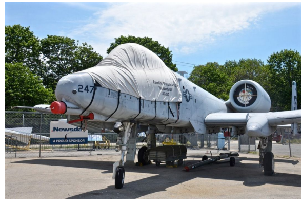
Fairchild A-10 Canopy Cover, open position Fairchild A10 Thunderbolt Canopy Cover, Nose Gun Cover, Gun Scoop Inlet Plug