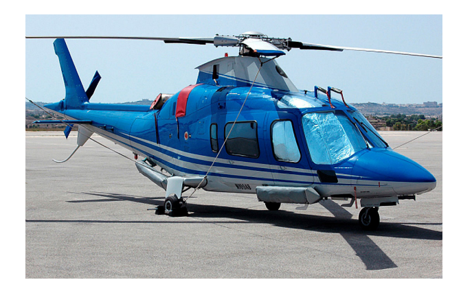
Agusta Power Cockpit HeatShields & Blade Tie-downs

Cabin Heatshields are interior sunshades for the aircraft's passenger cabin area. The product is a unique composite of closed-cell foam with a silver mylar finish. The semi-rigid design is stiff enough to stand inside the window framing. The set folds up flat and is easily stored in the included storage sleeve. Some designs may require velcro and suction cups. A Heatshield is an excellent short-term remedy for cockpit overheating, but an external fabric cover is more effective for long-term protection.