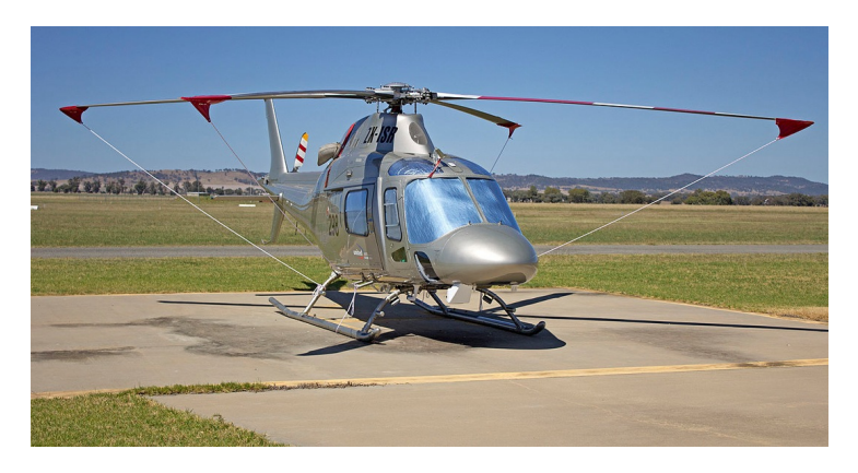
Agusta 119 Cockpit/Cabin HeatShields