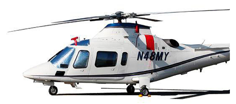
Agusta Power Engine Cover (illustration)