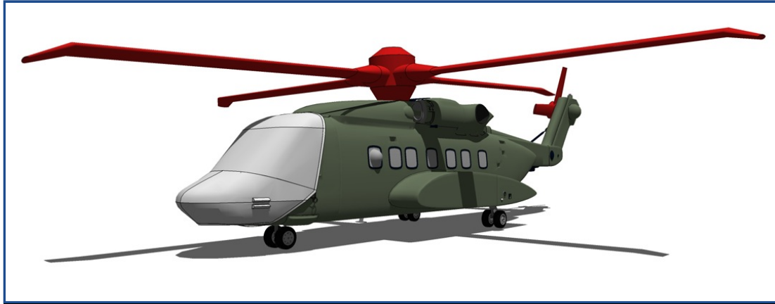
Sikorsky S-92 Windshield/Nose, Blade, Rotor Hub &amp; Tail Rotor Covers