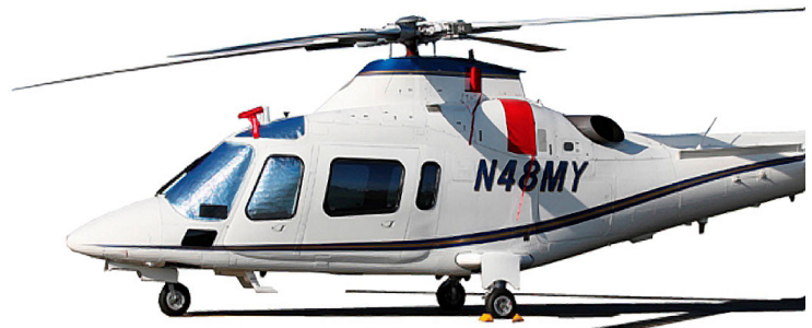
Agusta Power Pitot Covers, Intake Covers, and Cockpit Heatshield set