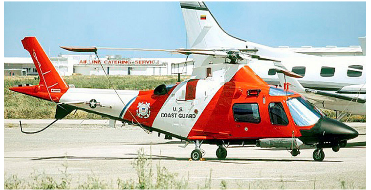
Agusta Power Cockpit HeatShields & Blade Tie-downs