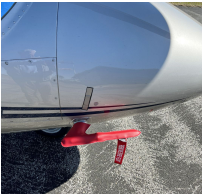
Agusta AW109 (A, C, & Trekker) Pitot Cover Set

The Engine Exhaust Plugs are custom fit for your Agusta AW139, AW189 exhaust openings, made with heavy-duty vinyl material, and stuffed with a single block of sculpted urethane foam. Exhaust plugs have 'Remove Before Flight' streamers sewn onto the face of the plugs. Exhaust plugs may be inserted soon after flight when the engine is still warm. Engine Inlet Plugs are commonly referred to as Cowl Plugs, Intake Plugs, Cowl Blocks, Engine Blocks, and Engine Bungs.