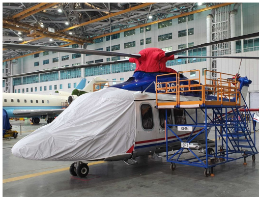
Agusta AW139 Cockpit/Nose, Rotor Mast Cover

WINTER USE MATERIAL - Made with Solution-Dyed Polyester fabric, this option is intended for seasonal use to aid in deicing, rain mitigation, or for occasional travel. The material is lighter and more compact, but more susceptible to UV damage and may have a shorter useful life if used continuously outside than the all-year use material.