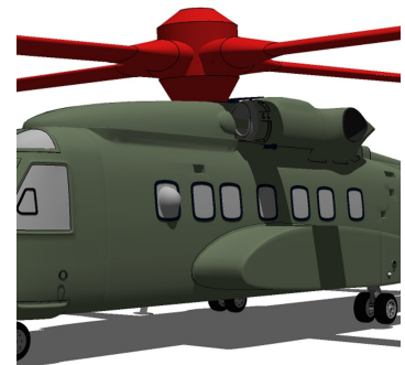
Sikorsky S-92 Main Rotor Hub Cover