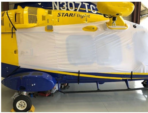
Leonardo (Agusta) A-169 Bubble Cover, test fit cover