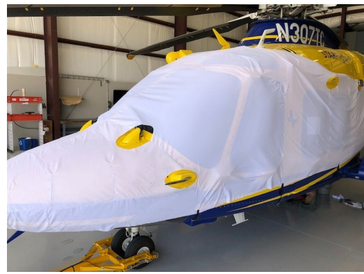
Leonardo (Agusta) A-169 Bubble Cover, test fit cover