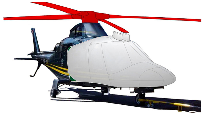
Agusta 109 Bubble, Rotor Hub &amp; Blade Covers (illustration)