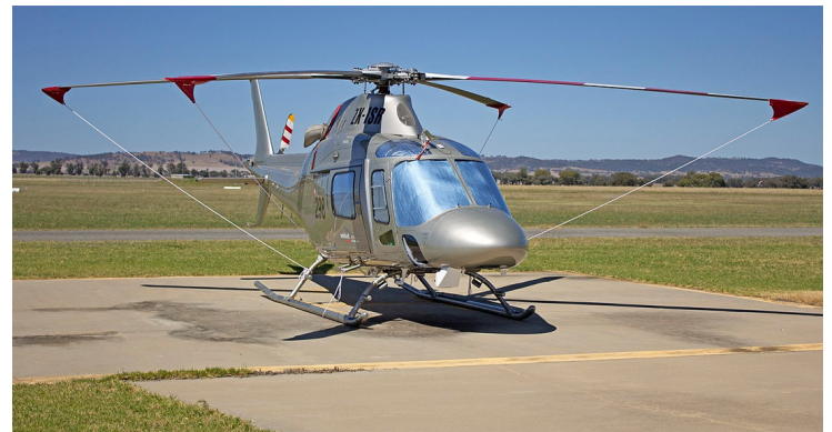
Agusta 119 Cockpit/Cabin HeatShields