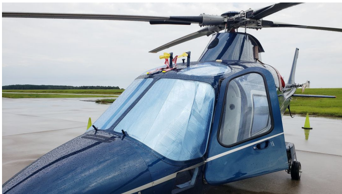
Agusta AW109S/SP Grand Heatshield Set

Cockpit Heatshields are interior sunshades for the aircraft's cockpit. The product is a unique composite of closed-cell foam with a silver mylar finish. The semi-rigid design is stiff enough to stand inside the window framing. Darts and folds are incorporated into the material so that it conforms to the complex shape of the helicopter windows. The set folds up flat and is easily stored in the included storage sleeve. Some designs may require velcro and suction cups. A Heatshield is an excellent short-term remedy for cockpit overheating, but an external fabric cover is more effective for long-term protection.