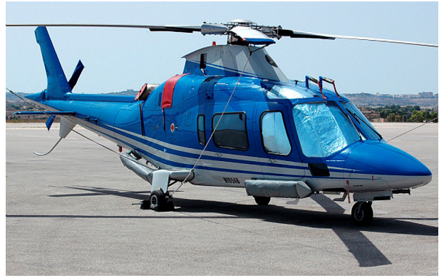
Agusta Power Cockpit HeatShields & Blade Tie-downs