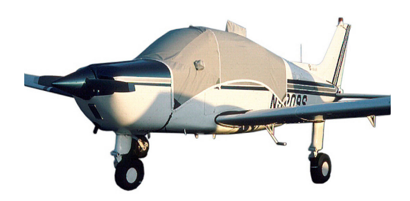
Beech Sport Canopy Cover

Travel Covers are made with Silver Solution-Dyed Polyester fabric and only lined over the windshield to save weight. The material is lightweight and more compact for easy stowage in the aircraft. The polyester material is water resistant, but only intended for occasional use outside. We also have an ultra lightweight material available for fitted hangar dust covers. For daily outdoor use, the non-travel Sunbrella Cover is the best choice.