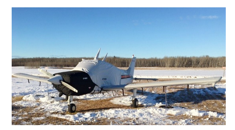
Beech Sport Insulated Engine Cover & Winter Cover Set

This cover type is made from Silver Acrylic Sunbrella canvas and is 100% lined with a soft and smooth microfiber. Bruce's Custom Covers developed this material combination especially for aircraft protection. The outer material is medium weight and treated for water resistance, UV resistance and anti-static buildup. The inner lining is a very soft and smooth microfiber to prevent scratching. The material is very reflective, and tests show that the cabin interior temperature can be reduced to near-ambient temperature on the hottest of days. It is water, ice and snow repellent, yet breathable to allow moisture to escape from between the cover and the aircraft surface.