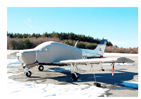
Prop, Engine, Extended Canopy, Wing, Tailcone, and Horizontal Stab Covers

WINTER USE MATERIAL - Made with Solution-Dyed Polyester fabric, this option is intended for seasonal use to aid in deicing, rain mitigation, or for occasional travel. The material is lighter and more compact, but more susceptible to UV damage and may have a shorter useful life if used continuously outside than the all-year use material.