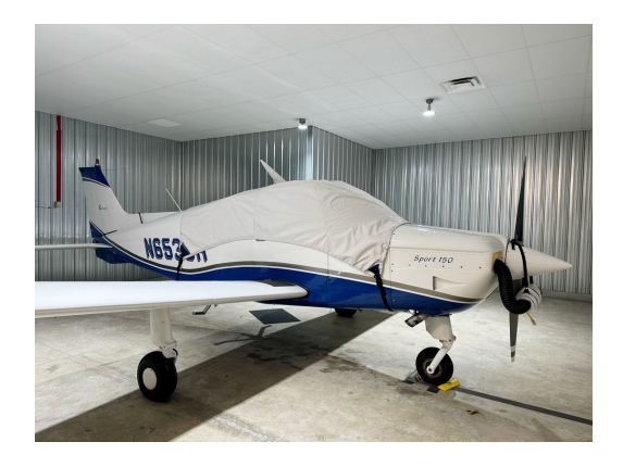
Beech Sport A19 Canopy Cover