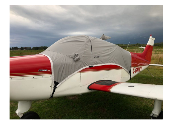
Beech Sundowner Travel Canopy Cover