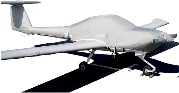
Diamond DA-20 Full Cover Set

WINTER USE MATERIAL - Made with Solution-Dyed Polyester fabric, this option is intended for seasonal use to aid in deicing, rain mitigation, or for occasional travel. The material is lighter and more compact, but more susceptible to UV damage and may have a shorter useful life if used continuously outside than the all-year use material.