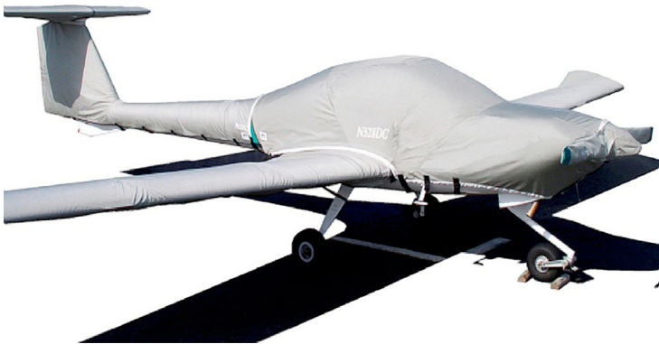
Diamond DA-20 Full Cover Set