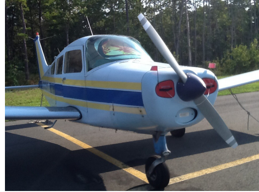
Beech Musketeer Engine Inlet Plugs