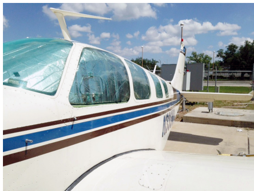
Beech Bonanza HeatShields

Windshield Heatshields are interior sunshades for an aircraft's front windshield. The product is a unique composite of closed-cell foam with a silver mylar finish. The semi-rigid design is stiff enough to stand along the inside of the windshield using sun visors or window framing. It folds up flat and easily stores in the included storage sleeve. Some designs may require velcro and suction cups or split right and left sides. A Heatshield is an excellent short-term remedy for cockpit overheating. An external fabric cover is far more effective and practical for long-term protection.