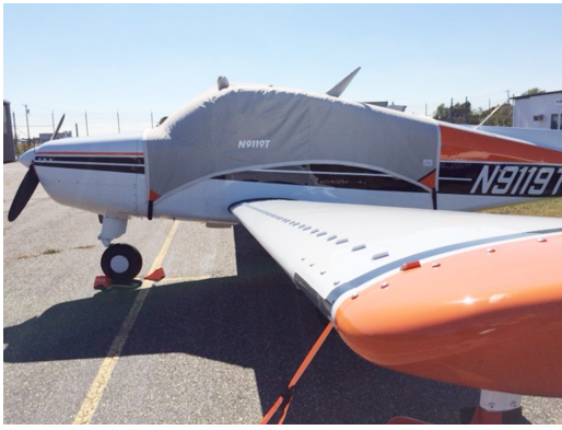
Beech Musketeer Canopy Cover