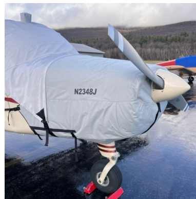
Beech Musketeer Insulated Engine Cover