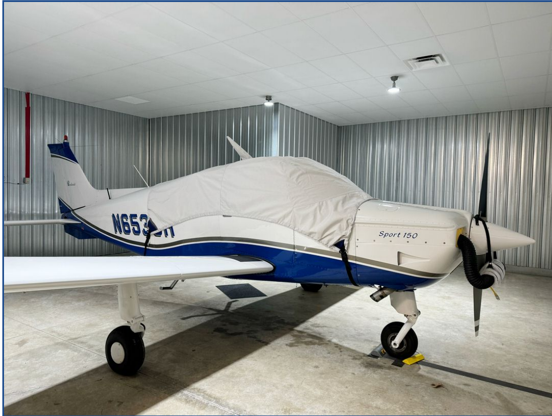
Beech Sport A19 Canopy Cover