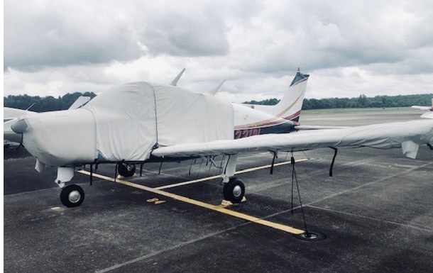
Beech Sundowner Extended Canopy Cover, Fully Enclosed Engine Cover, Wing Covers

This cover type is made from Silver Acrylic Sunbrella canvas and is 100% lined with a soft and smooth microfiber. Bruce's Custom Covers developed this material combination especially for aircraft protection. The outer material is medium weight and treated for water resistance, UV resistance and anti-static buildup. The inner lining is a very soft and smooth microfiber to prevent scratching. The material is very reflective, and tests show that the cabin interior temperature can be reduced to near-ambient temperature on the hottest of days. It is water, ice and snow repellent, yet breathable to allow moisture to escape from between the cover and the aircraft surface.