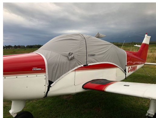
Beech Sundowner Travel Canopy Cover