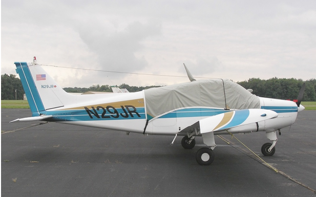
Beech Musketeer Canopy Cover

This cover type is made from Silver Acrylic Sunbrella canvas and is 100% lined with a soft and smooth microfiber. Bruce's Custom Covers developed this material combination especially for aircraft protection. The outer material is medium weight and treated for water resistance, UV resistance and anti-static buildup. The inner lining is a very soft and smooth microfiber to prevent scratching. The material is very reflective, and tests show that the cabin interior temperature can be reduced to near-ambient temperature on the hottest of days. It is water, ice and snow repellent, yet breathable to allow moisture to escape from between the cover and the aircraft surface.