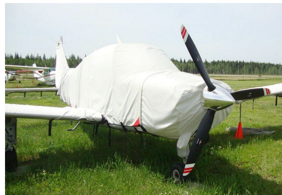
Beech Sierra Extended Canopy, Engine, Prop, Wings, Stab & Tailcone Covers