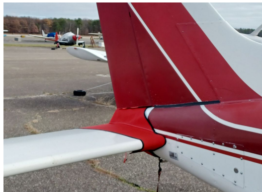
Beech C23 Sundowner Tailcone Cover, fully enclosed