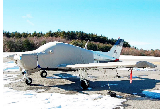
Prop, Engine, Extended Canopy, Wing, Tailcone, and Horizontal Stab Covers