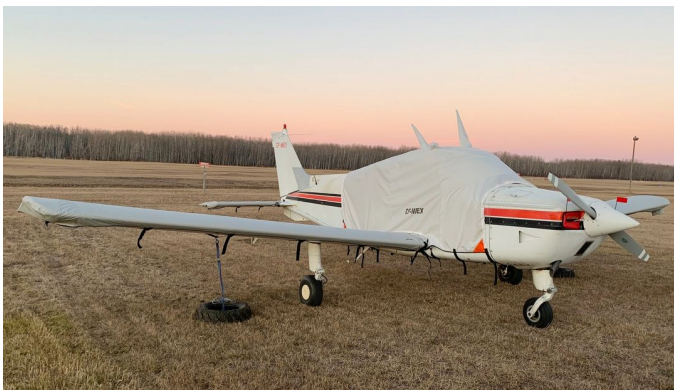
Sport B19 Engine Inlet Plugs

WINTER USE MATERIAL - Made with Solution-Dyed Polyester fabric, this option is intended for seasonal use to aid in deicing, rain mitigation, or for occasional travel. The material is lighter and more compact, but more susceptible to UV damage and may have a shorter useful life if used continuously outside than the all-year use material.