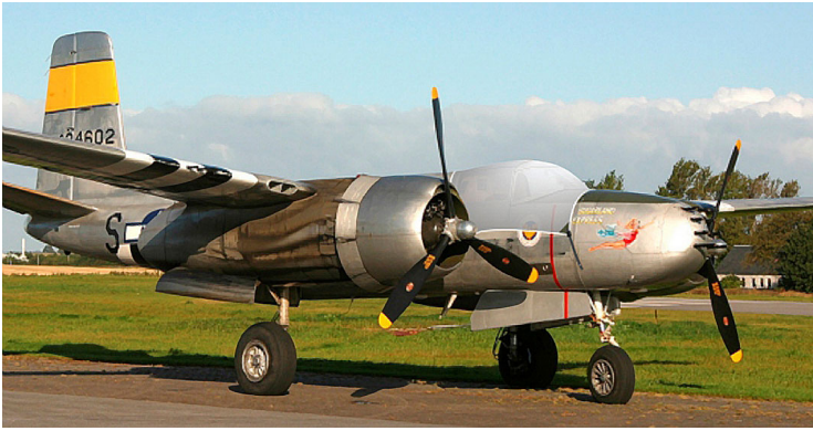
A-26 Invader Cockpit Cover (Illustration)

the hottest of days. It is water, ice and snow repellent, yet breathable to allow moisture to escape from between the cover and the aircraft surface.