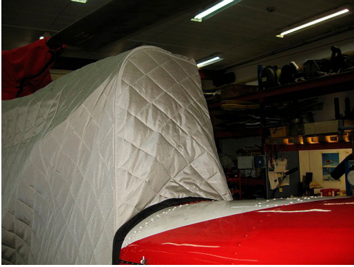
Alouette III Insulated Engine/Transmission Cover

WINTER USE MATERIAL - Made with Solution-Dyed Polyester fabric, this option is intended for seasonal use to aid in deicing, rain mitigation, or for occasional travel. The material is lighter and more compact, but more susceptible to UV damage and may have a shorter useful life if used continuously outside than the all-year use material.