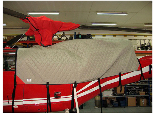
Alouette III Rotor Hub Cover & Engine/Transmission Cover Alouette III Rotor Hub Cover, Insulated Engine/Transmission Cover