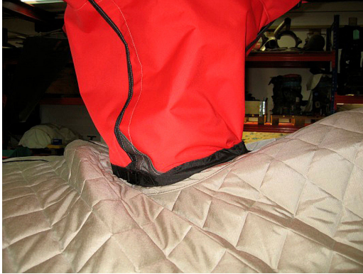
Alouette III Rotor Hub Cover & Engine/Transmission Cover

WINTER USE MATERIAL - Made with Solution-Dyed Polyester fabric, this option is intended for seasonal use to aid in deicing, rain mitigation, or for occasional travel. The material is lighter and more compact, but more susceptible to UV damage and may have a shorter useful life if used continuously outside than the all-year use material.