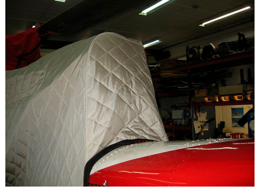
Alouette III Insulated Engine/Transmission Cover