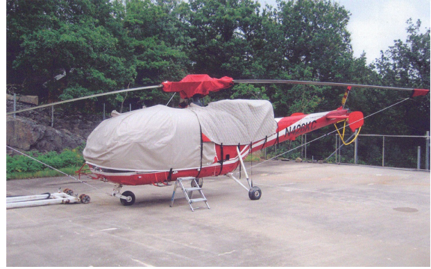
Alouette III Bubble, Rotor Hub & Engine Covers, Blade Tie-Downs