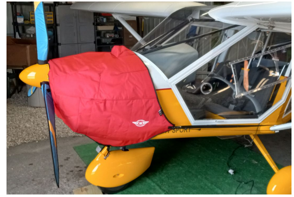
Aeroprakt A-22 Insulated Engine Cover