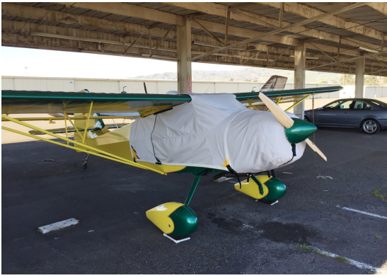
Kitfox Canopy & Engine Covers