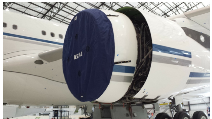
Airbus 340 Intake Covers