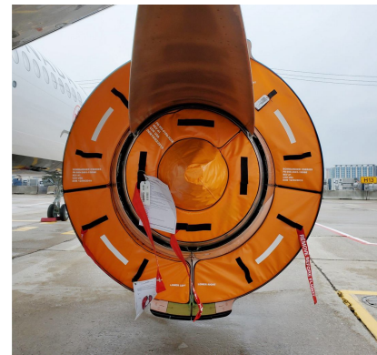
Airbus A320 Exhaust & Bypass Vent Plugs