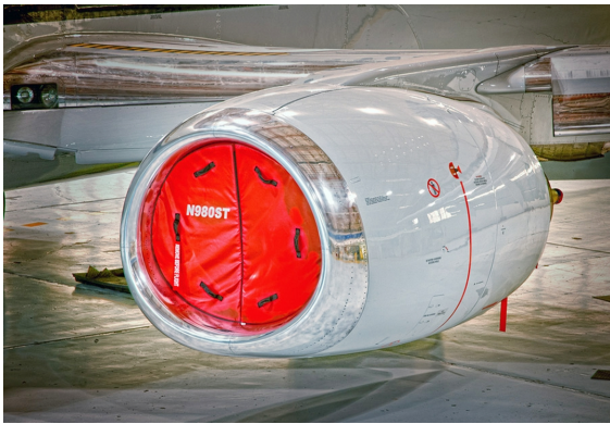
Boeing 737 Next Gen Engine Intake Plug, Folding Type

The Engine Inlet Plugs are custom fit for your Airbus A320 intakes, made with heavy-duty vinyl material, and stuffed with a single block of sculpted urethane foam. Each plug has a zipper that allows the foam to be removed and dried if necessary. Engine plugs have 'remove before flight' streamers sewn onto the face of the plugs. Most plugs are imprinted with the aircraft registration number in black for an extra charge. Storage bag NOT included. Engine plugs may be inserted after flight when the engine is still warm. Engine Inlet Plugs are commonly referred to as Cowl Plugs, Intake Plugs, Cowl Blocks, Engine Blocks, and Engine Bungs.