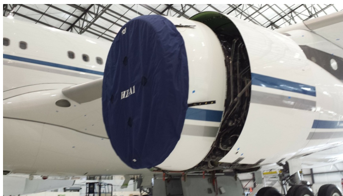
Airbus 340 Intake Covers