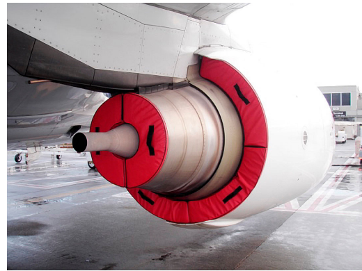
Boeing 737 NG Exhaust Plug Set, Folding Donut Ring Type