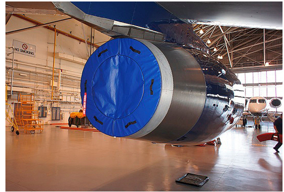
Boeing 757 Exhaust Plugs