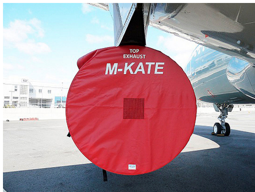
Airbus A319 Intake/Exhaust Covers set, IAE V2500