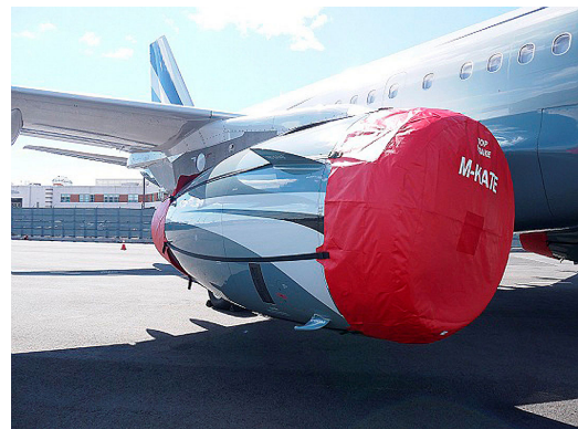
Airbus A319 Intake/Exhaust Covers set, IAE V2500