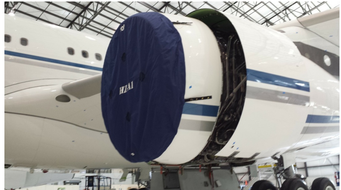
Airbus 340 Intake Covers