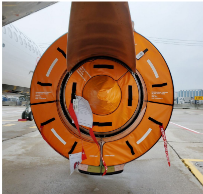
Airbus A320 Exhaust & Bypass Vent Plugs

The Engine Inlet Plugs are custom fit for your Airbus A340 intakes, made with heavy-duty vinyl material, and stuffed with a single block of sculpted urethane foam. Each plug has a zipper that allows the foam to be removed and dried if necessary. Engine plugs have 'remove before flight' streamers sewn onto the face of the plugs. Most plugs are imprinted with the aircraft registration number in black for an extra charge. Storage bag NOT included. Engine plugs may be inserted after flight when the engine is still warm. Engine Inlet Plugs are commonly referred to as Cowl Plugs, Intake Plugs, Cowl Blocks, Engine Blocks, and Engine Bungs.