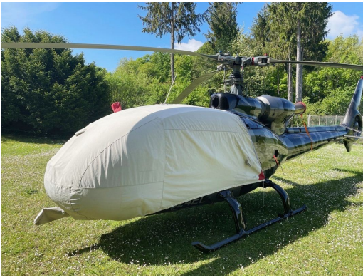
Aerospatiale Gazelle Bubble Cover