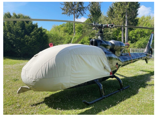
Aerospatiale Gazelle Bubble Cover