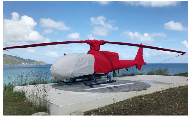
Aerospatiale AS341/342 Gazelle Full Cover Set