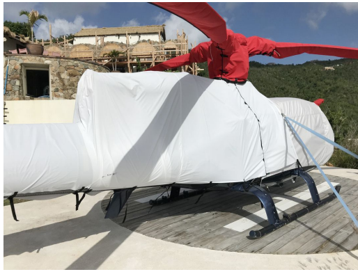
Aerospatiale Gazelle AS341 Bubble, Rotor Mast, Blade, Engine & Tailboom Covers (some are test fit covers)