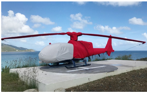
Aerospatiale AS341/342 Gazelle Full Cover Set