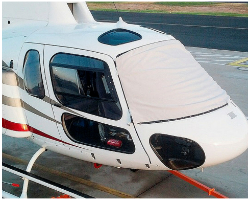
AS350 Windshield Cover, pinches in door jambs