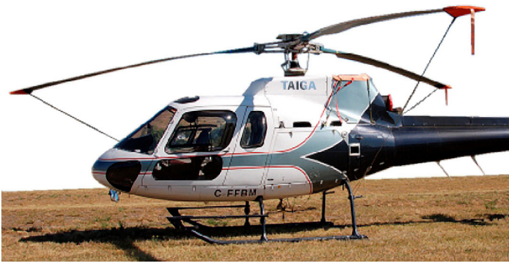
AS350 Blade Tie-Downs

WINTER USE MATERIAL - Made with Solution-Dyed Polyester fabric, this option is intended for seasonal use to aid in deicing, rain mitigation, or for occasional travel. The material is lighter and more compact, but more susceptible to UV damage and may have a shorter useful life if used continuously outside than the all-year use material.