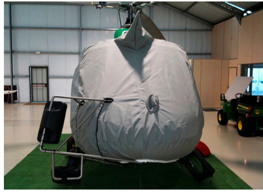
AS350 Bubble Cover with Wire Strike and Cargo Mirror