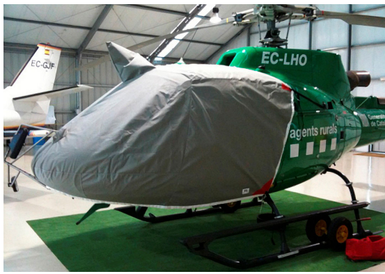
AS350 Bubble Cover with Wire Strike and Cargo Mirror