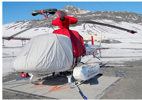
AS350 Bubble Cover w/ Cargo Mirror, Blade Tie-downs, Insulated Engine, Insulated Main Rotor Hub and Insulated Tail Rotor Covers