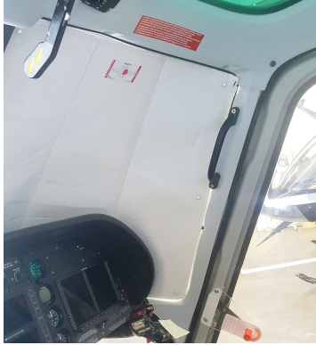
Aerospatiale AS350 Astar, Ecureuil, Esquilo, Fenec Windshield Heatshields

Heatshields are interior sunshades for an aircraft's windows or canopy glass. The product is a unique composite of closed-cell foam with a silver mylar finish. The semi-rigid design is stiff enough to stand along the inside of the windshield using sun visors or window framing. It folds up flat and easily stores in the included storage sleeve. Some designs may require velcro and suction cups. A Heatshield is an excellent short-term remedy for cockpit overheating.