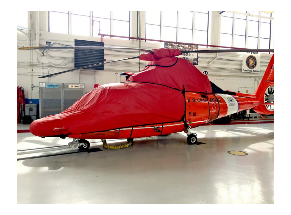
MH-65C Rotor Hub, Swash Plate Aperture, Engine Area Cover set, U.S. Coast Guard HH-65 Dolphin Bubble, Engine & Rotor P/N: A365-210