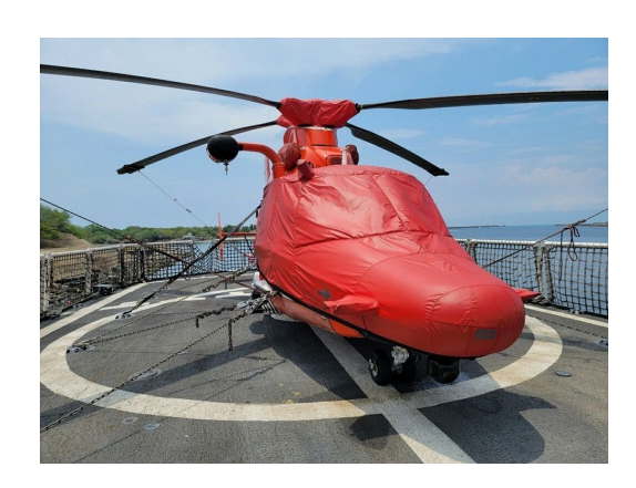
U.S. Coast Guard HH-65 Dolphin Bubble, Engine & Rotor Mast Covers Aerospatiale AS365N2 Bubble, w/Extended Nose/Radome