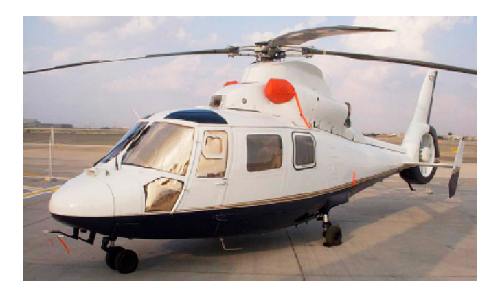
Dauphin HeatShield Set

foam with a silver mylar finish. The semi-rigid design is stiff enough to stand along the inside of the windshield using sun visors or window framing. It folds up flat and easily stores in the included storage sleeve. Some designs may require velcro and suction cups. A Heatshield is an excellent short-term remedy for cockpit overheating.