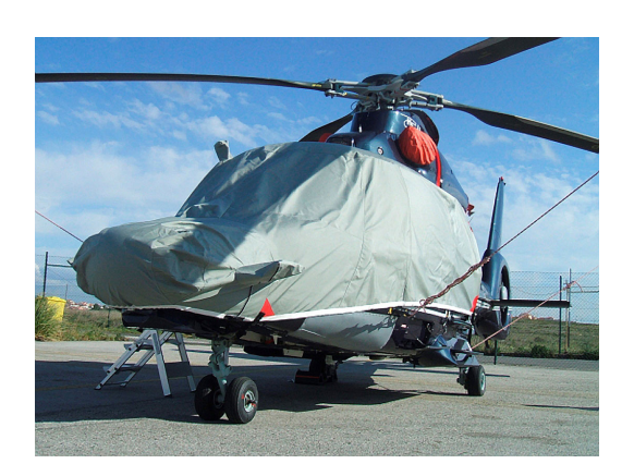
Dauphin Bubble Cover, extended nose

Travel Covers are made with Silver Solution-Dyed Polyester fabric and fully lined over the entire cover. The material is lightweight and more compact for easy stowage in the aircraft. The polyester material is water resistant, but only intended for occasional use outside. We also have an ultra lightweight material available for fitted hangar dust covers. For daily outdoor use, the non-travel Sunbrella Cover is the best choice.