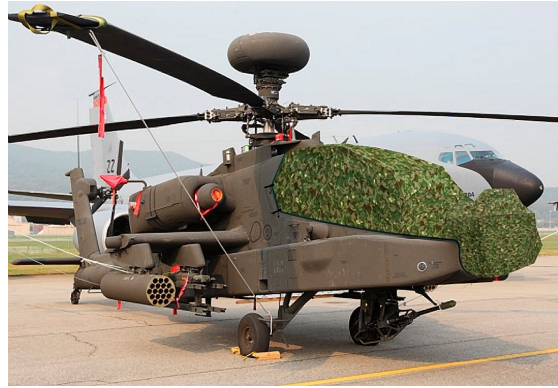
Canopy/Nose Cover, covers canopy glass and TADS

Canopy/Nose Covers enclose the entire canopy including the windshield, skylights, and chin bubble. Attachment buckles are made of nonmetal Delrin , designed for rugged outdoor use. Both the top and bottom hems of the cover have a special rope-hem feature with which they can be tightened to help prevent abrasive chafing of the windshield. Pockets are sewn into the cover for the temperature probe and pitot tubes. The bubble cover is reinforced with patches at hinge points, door handles, and for the windshield wipers. For ease of installation, the bubble cover is color-coded (red=left, green=right) with color swatches sewn into the corners. This cover type is made from Silver Acrylic Sunbrella canvas and is 100% lined with a soft and smooth microfiber. Bruce's Custom Covers developed this material combination especially for aircraft protection. The outer material is medium weight and treated for water resistance, UV resistance and anti-static buildup. The inner lining is a very soft and smooth microfiber to prevent scratching. The material is very reflective, and tests show that the cabin interior temperature can be reduced to near-ambient temperature on the hottest of days. It is water, ice and snow repellent, yet breathable to allow moisture to escape from between the cover and the aircraft surface.