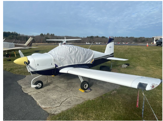
Grumman AA-1A Canopy Cover