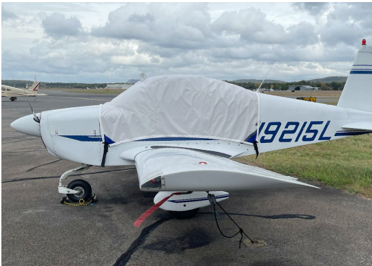
Grumman AA-1 Canopy Cover