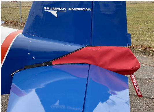
Grumman AA-1 Tailcone Cover