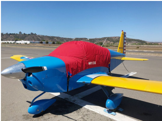
American AA-1 Custom Colored Canopy Cover

This cover type is made from Silver Acrylic Sunbrella canvas and is 100% lined with a soft and smooth microfiber. Bruce's Custom Covers developed this material combination especially for aircraft protection. The outer material is medium weight and treated for water resistance, UV resistance and anti-static buildup. The inner lining is a very soft and smooth microfiber to prevent scratching. The material is very reflective, and tests show that the cabin interior temperature can be reduced to near-ambient temperature on the hottest of days. It is water, ice and snow repellent, yet breathable to allow moisture to escape from between the cover and the aircraft surface.