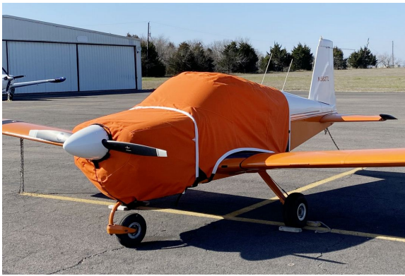
AA-1 Extended Canopy & Fully Enclosed Engine Cover

This cover type is made from Silver Acrylic Sunbrella canvas and is 100% lined with a soft and smooth microfiber. Bruce's Custom Covers developed this material combination especially for aircraft protection. The outer material is medium weight and treated for water resistance, UV resistance and anti-static buildup. The inner lining is a very soft and smooth microfiber to prevent scratching. The material is very reflective, and tests show that the cabin interior temperature can be reduced to near-ambient temperature on the hottest of days. It is water, ice and snow repellent, yet breathable to allow moisture to escape from between the cover and the aircraft surface.