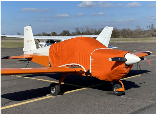
AA-1 Extended Canopy & Fully Enclosed Engine Cover