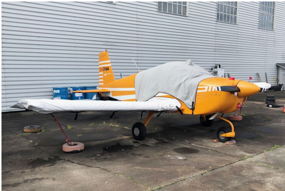
Grumman AA1B Yankee Wing Covers & Engine Inlet Plugs

WINTER USE MATERIAL - Made with Solution-Dyed Polyester fabric, this option is intended for seasonal use to aid in deicing, rain mitigation, or for occasional travel. The material is lighter and more compact, but more susceptible to UV damage and may have a shorter useful life if used continuously outside than the all-year use material.