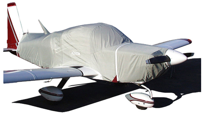
Grumman AA-5 Extended Canopy Cover & Engine Cover