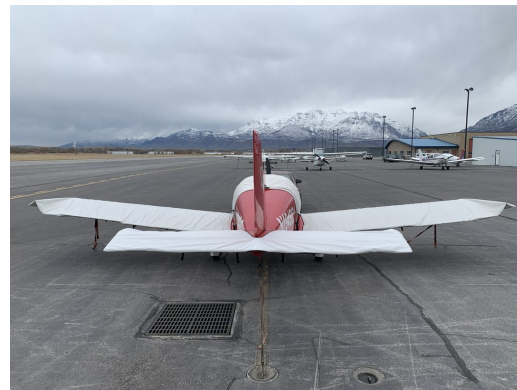
Grumman AA-1 Wing & Horizontal Stabilizer Covers