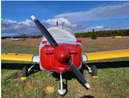
Grumman AA-1A Lynx Engine Inlet Plugs