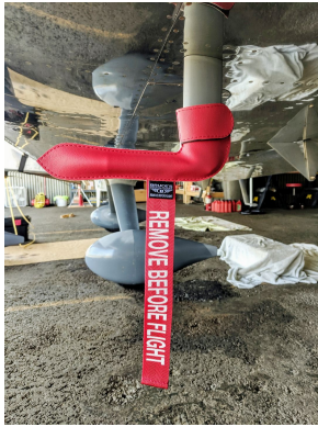
Van's RV-14 Pitot Cover

and dried if necessary. Engine plugs have warning flags that are visible from the cockpit or 'remove before flight' streamers sewn onto the face of the plugs. Most plugs are imprinted with the aircraft registration number in black for an extra charge. Storage bag NOT included. Engine plugs may be inserted after flight when the engine is still warm. Engine Inlet Plugs are commonly referred to as Cowl Plugs, Intake Plugs, Cowl Blocks, Engine Blocks, and Engine Bungs.