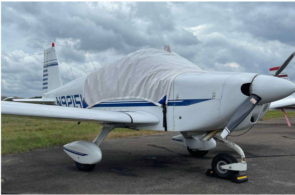
Grumman AA-1A Canopy Cover

This cover type is made from Silver Acrylic Sunbrella canvas and is 100% lined with a soft and smooth microfiber. Bruce's Custom Covers developed this material combination especially for aircraft protection. The outer material is medium weight and treated for water resistance, UV resistance and anti-static buildup. The inner lining is a very soft and smooth microfiber to prevent scratching. The material is very reflective, and tests show that the cabin interior temperature can be reduced to near-ambient temperature on the hottest of days. It is water, ice and snow repellent, yet breathable to allow moisture to escape from between the cover and the aircraft surface.