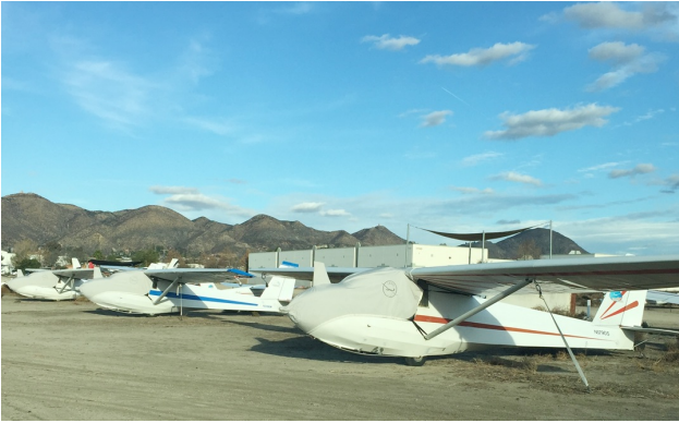
Schweizer SGS 2-33 Canopy/Nose Covers