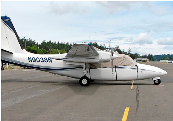
Aero Commander 500 Canopy Cover

This cover type is made from Silver Acrylic Sunbrella canvas and is 100% lined with a soft and smooth microfiber. Bruce's Custom Covers developed this material combination especially for aircraft protection. The outer material is medium weight and treated for water resistance, UV resistance and anti-static buildup. The inner lining is a very soft and smooth microfiber to prevent scratching. The material is very reflective, and tests show that the cabin interior temperature can be reduced to near-ambient temperature on the hottest of days. It is water, ice and snow repellent, yet breathable to allow moisture to escape from between the cover and the aircraft surface.