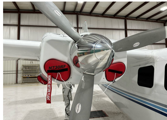
Aero Commander 500B Engine Intake Plugs