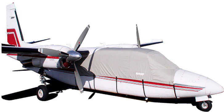
Aero Commander 690b Canopy Cover

Travel Covers are made with Silver Solution-Dyed Polyester fabric and only lined over the windshield to save weight. The material is lightweight and more compact for easy stowage in the aircraft. The polyester material is water resistant, but only intended for occasional use outside. We also have an ultra lightweight material available for fitted hangar dust covers. For daily outdoor use, the non-travel Sunbrella Cover is the best choice.