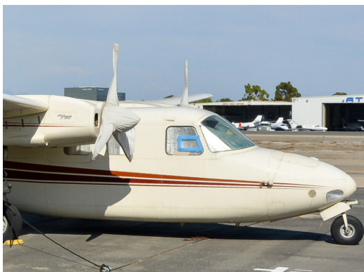
Aero Commander AC500 Ptopellor/Spinner Covers

This cover type is made from Silver Acrylic Sunbrella canvas and is 100% lined with a soft and smooth microfiber. Bruce's Custom Covers developed this material combination especially for aircraft protection. The outer material is medium weight and treated for water resistance, UV resistance and anti-static buildup. The inner lining is a very soft and smooth microfiber to prevent scratching. The material is very reflective, and tests show that the cabin interior temperature can be reduced to near-ambient temperature on the hottest of days. It is water, ice and snow repellent, yet breathable to allow moisture to escape from between the cover and the aircraft surface.