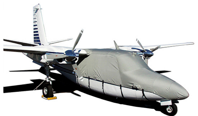
Aero Commander 500S Canopy/Nose Cover