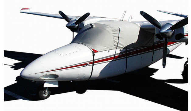
Aero Commander 680 Canopy Cover