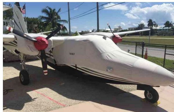
Twin Commander 560F Canopy/Nose & Engine Covers