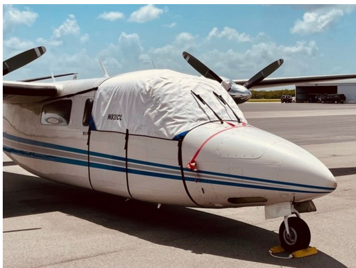
Aero Commander 690C Cockpit Cover

This cover type is made from Silver Acrylic Sunbrella canvas and is 100% lined with a soft and smooth microfiber. Bruce's Custom Covers developed this material combination especially for aircraft protection. The outer material is medium weight and treated for water resistance, UV resistance and anti-static buildup. The inner lining is a very soft and smooth microfiber to prevent scratching. The material is very reflective, and tests show that the cabin interior temperature can be reduced to near-ambient temperature on the hottest of days. It is water, ice and snow repellent, yet breathable to allow moisture to escape from between the cover and the aircraft surface.