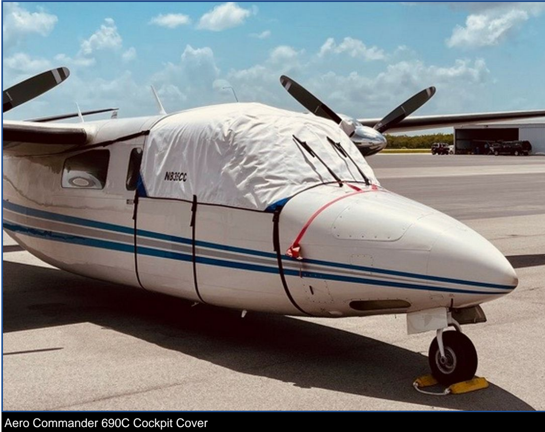
Aero Commander 690C Cockpit Cover