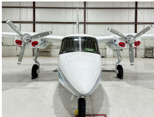
Aero Commander 500B Engine Intake Plugs

Engine Inlet Plugs are custom fit for your Rockwell Commander 500, 520, 560, Short 680 intakes, made with heavy-duty vinyl material, and stuffed with a single block of sculpted urethane foam. Each plug has a zipper that allows the foam to be removed and dried if necessary. Engine plugs have warning flags that are visible from the cockpit or 'remove before flight' streamers sewn onto the face of the plugs. Most plugs are imprinted with the aircraft registration number in black for an extra charge. Storage bag NOT included. Engine plugs may be inserted after flight when the engine is still warm. Engine Inlet Plugs are commonly referred to as Cowl Plugs, Intake Plugs, Cowl Blocks, Engine Blocks, and Engine Bung.