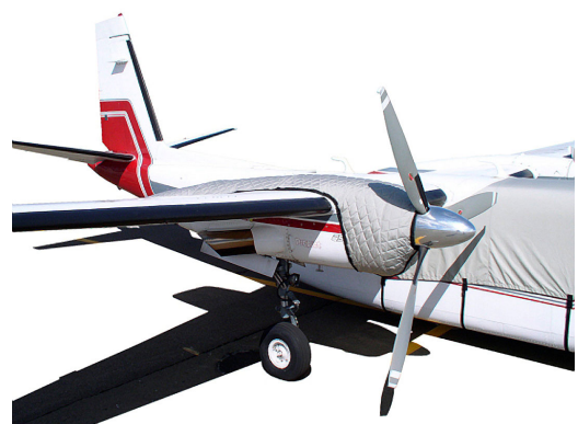
Aero Commander Insulated Engine Cover