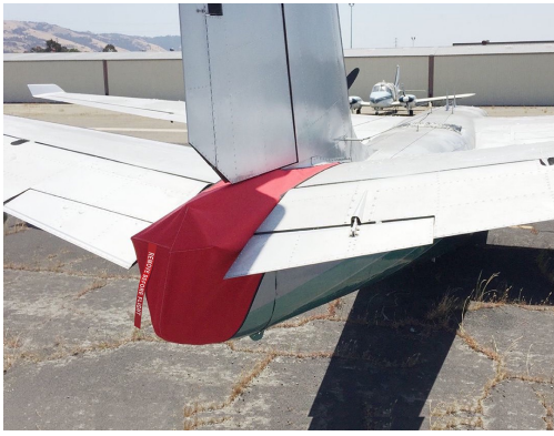
Rockwell Aero Commander Tailcone Cover