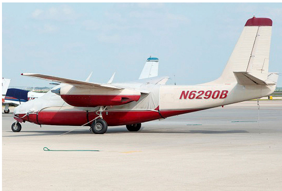
Aero Commander 500 Canopy/Nose Cover, Over-Top Type

Travel Covers are made with Silver Solution-Dyed Polyester fabric and only lined over the windshield to save weight. The material is lightweight and more compact for easy stowage in the aircraft. The polyester material is water resistant, but only intended for occasional use outside. We also have an ultra lightweight material available for fitted hangar dust covers. For daily outdoor use, the non-travel Sunbrella Cover is the best choice.