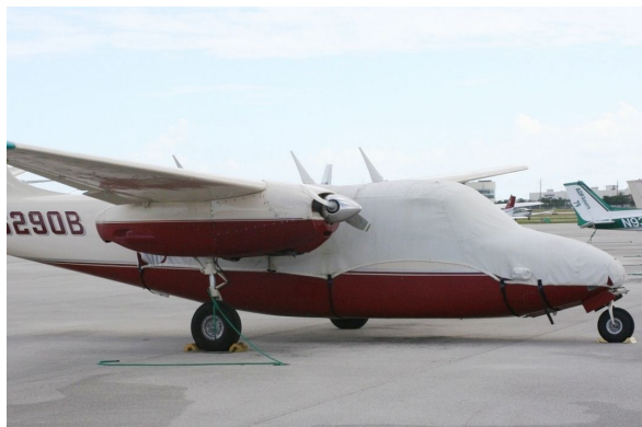
Aero Commander 500 Canopy/Nose Cover Over The Type