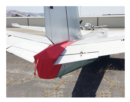
Rockwell Aero Commander Tailcone Cover