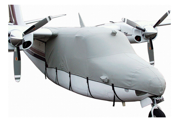
Canopy/Nose Cover (extends over top past leading edge)