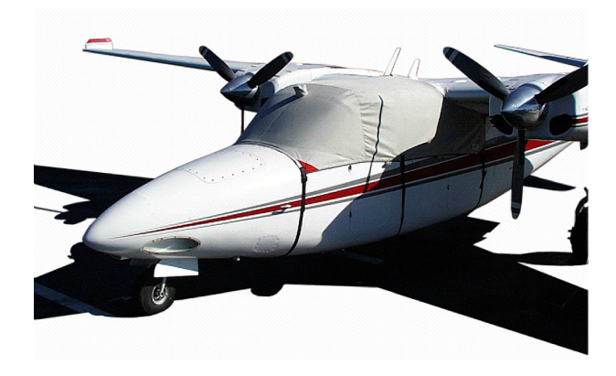
Aero Commander 680 Canopy Cover

Travel Covers are made with Silver Solution-Dyed Polyester fabric and only lined over the windshield to save weight. The material is lightweight and more compact for easy stowage in the aircraft. The polyester material is water resistant, but only intended for occasional use outside. We also have an ultra lightweight material available for fitted hangar dust covers. For daily outdoor use, the non-travel Sunbrella Cover is the best choice.