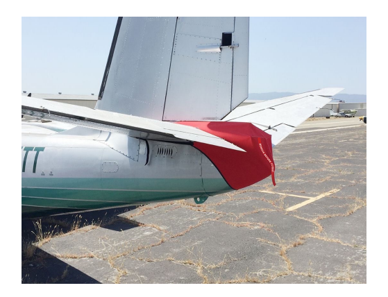
Rockwell Aero Commander Tailcone Cover

The Rockwell Aero Commander 680 Tailcone Cover fits onto the tailcone area to cover the holes that birds can fly into and nest. The cover easily straps onto the leading edge of the horizontal stabilizer with padded hooks or overlaps with the elevators slightly and attaches under the horizontal stabilizers with adjustable straps. Tailcone Covers are normally made with Solution-Dyed Polyester or Acrylic Sunbrella .