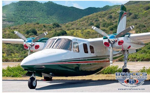
Aero Commander 500 Engine Inlet Plugs