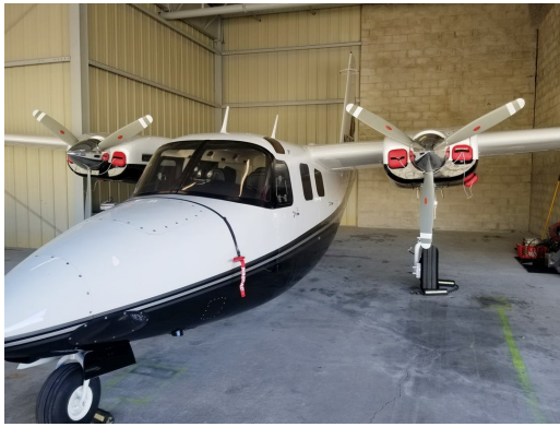
Aero Commander 500-A Pitot Covers