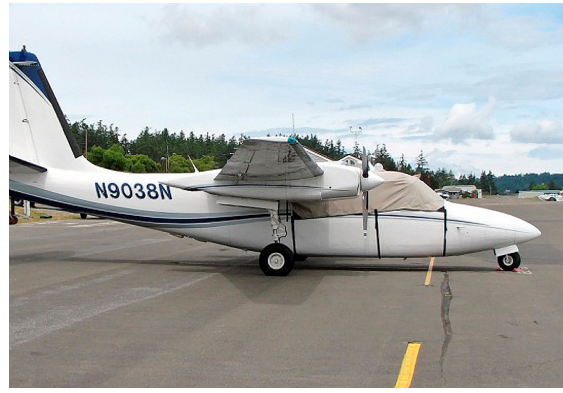
Aero Commander 500 Canopy Cover