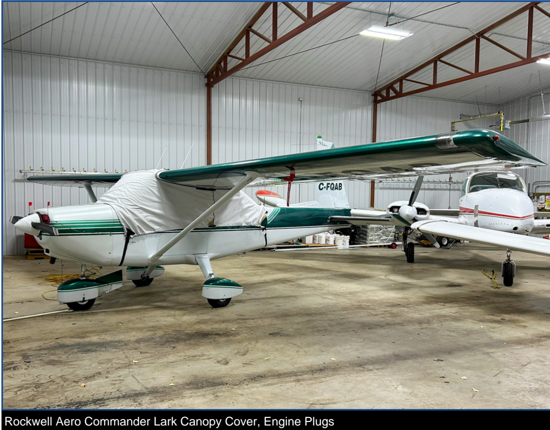
Rockwell Aero Commander Lark Canopy Cover, Engine Plugs