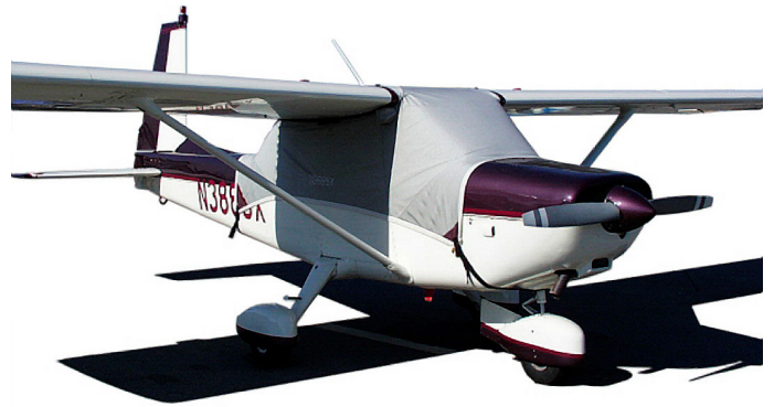
Lark Canopy Cover