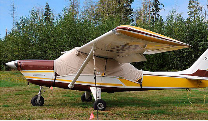
Lark Canopy Cover

water resistance, UV resistance and anti-static buildup. The inner lining is a very soft and smooth microfiber to prevent scratching. The material is very reflective, and tests show that the cabin interior temperature can be reduced to near-ambient temperature on the hottest of days. It is water, ice and snow repellent, yet breathable to allow moisture to escape from between the cover and the aircraft surface.