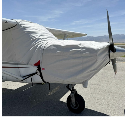
Aero Commander Lark Engine Cover

water resistance, UV resistance and anti-static buildup. The inner lining is a very soft and smooth microfiber to prevent scratching. The material is very reflective, and tests show that the cabin interior temperature can be reduced to near-ambient temperature on the hottest of days. It is water, ice and snow repellent, yet breathable to allow moisture to escape from between the cover and the aircraft surface.