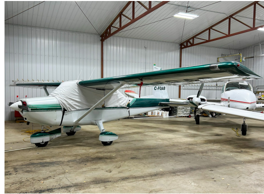
Rockwell Aero Commander Lark Canopy Cover, Engine Plugs