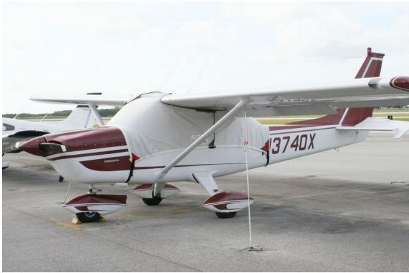
Rockwell Lark Commander Canopy Cover

The material is very reflective, and tests show that the cabin interior temperature can be reduced to near-ambient temperature on the hottest of days. It is water, ice and snow repellent, yet breathable to allow moisture to escape from between the cover and the aircraft surface.