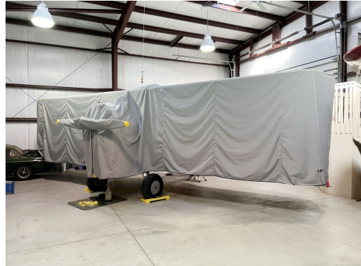
Stearman PT-13 Hangar Dust Cover, 3D model