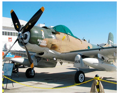
Douglas Skyraider Canopy Cover