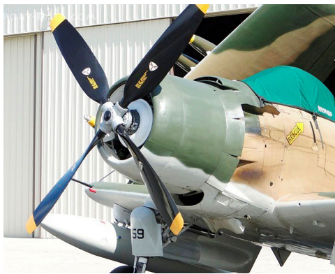
Douglas Skyraider Canopy Cover