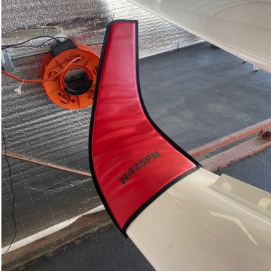
Stemme S-10 & S-12 Wingtip Pads

Designed to prevent damage to the wingtip in crowded hangars or high traffic areas, these products are made of bright red Naugahyde and thickly padded with a sandwich of closed cell foam. Protects delicate winglets, casters and their housings, and soft finishes.