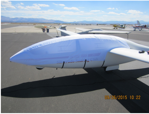
DG-505 Canopy/Nose Cover (test fit cover)

the hottest of days. It is water, ice and snow repellent, yet breathable to allow moisture to escape from between the cover and the aircraft surface.