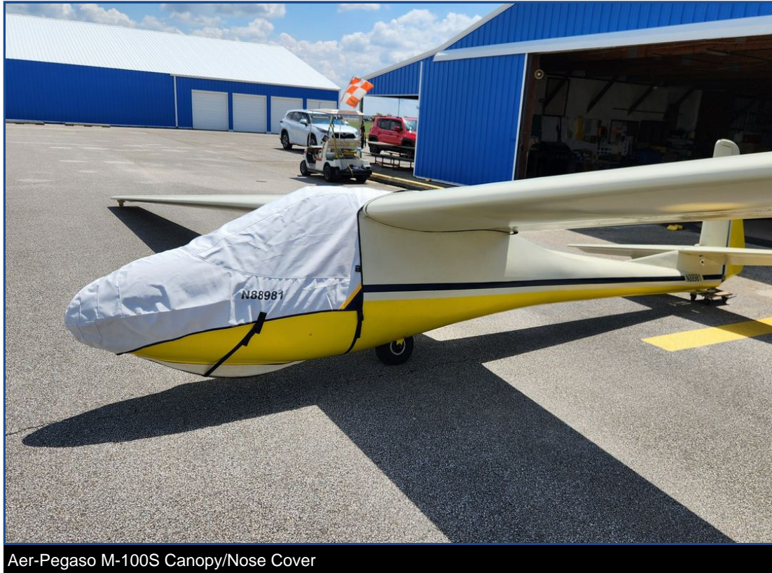
Aer-Pegaso M-100S Canopy/Nose Cover