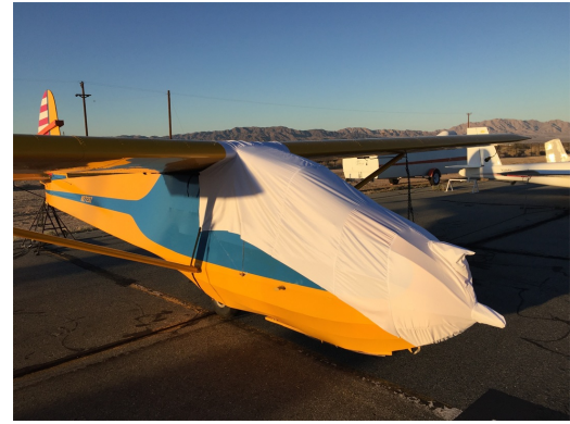
Schweizer SGU 2-22EK Canopy/Nose Cover, test fit cover