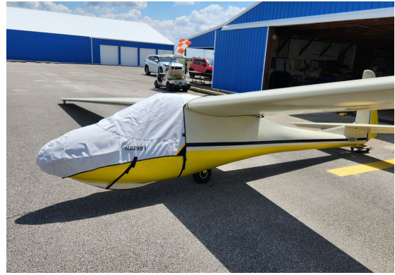
Aer-Pegaso M-100S Canopy/Nose Cover