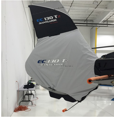
EC-130 Tailfan Cover

The Tailboom Cover details vary by model, but generally the helicopter tail boom cover encloses the tail boom from the "bottleneck" to the aft end. They usually also cover the horizontal stabilizers, and are custom made to allow for antennae, lights, and other protrusions. They attach with straps underneath the tail boom. Covers for the vertical and horizontal stabilizers are also available separately. Specific information for each model is available on request.