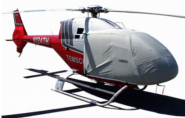
Eurocopter EC-120 Bubble Cover & Tailfan Cover

This cover type is made from Silver Acrylic Sunbrella canvas and is 100% lined with a soft and smooth microfiber. Bruce's Custom Covers developed this material combination especially for aircraft protection. The outer material is medium weight and treated for water resistance, UV resistance and anti-static buildup. The inner lining is a very soft and smooth microfiber to prevent scratching. The material is very reflective, and tests show that the cabin interior temperature can be reduced to near-ambient temperature on the hottest of days. It is water, ice and snow repellent, yet breathable to allow moisture to escape from between the cover and the aircraft surface.