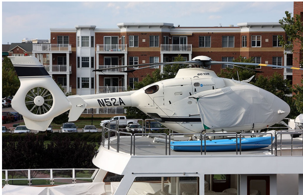
Eurocopter EC-135 Bubble Cover

This cover type is made from Silver Acrylic Sunbrella canvas and is 100% lined with a soft and smooth microfiber. Bruce's Custom Covers developed this material combination especially for aircraft protection. The outer material is medium weight and treated for water resistance, UV resistance and anti-static buildup. The inner lining is a very soft and smooth microfiber to prevent scratching. The material is very reflective, and tests show that the cabin interior temperature can be reduced to near-ambient temperature on the hottest of days. It is water, ice and snow repellent, yet breathable to allow moisture to escape from between the cover and the aircraft surface.