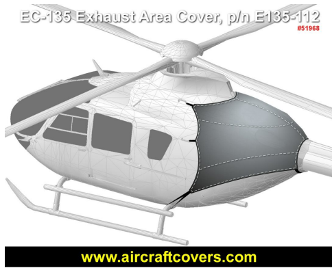
EC135 Exhaust Area Cover, illustration

The Airbus Helicopter EC-135 Intake Cover . Details vary by model, but generally helicopter intake covers are designed to enclose the intake are only. They are smaller than helicopter engine covers, and their attachment details can vary from straps, to snaps, or some combination of the two. Specific information for each model is available on request.