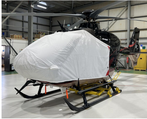
Airbus EC-135 Bubble Cover (with Wire Strike)