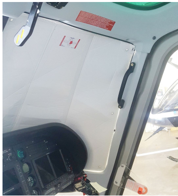
Aerospaiale AS350 Astar, Ecureuil, Esquilo, Fennec Windshield Heatshields

Heatshields are interior sunshades for an aircraft's windows or canopy glass. The product is a unique composite of closed-cell foam with a silver mylar finish. The semi-rigid design is stiff enough to stand along the inside of the windshield using sun visors or window framing. It folds up flat and easily stores in the included storage sleeve. Some designs may require velcro and suction cups. A Heatshield is an excellent short-term remedy for cockpit overheating.