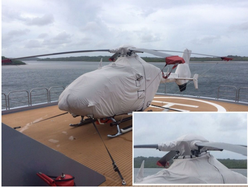
Airbus Helicopter AH135 Main Rotor Hub Cover

The Airbus Helicopter EC-135 Intake Cover . Details vary by model, but generally helicopter intake covers are designed to enclose the intake area only. They are smaller than helicopter engine covers, and their attachment details can vary from straps, to snaps, or some combination of the two. Specific information for each model is available on request.