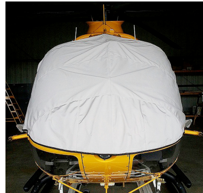
EC-135 Windshield/Skylights Cover, pinches in door jambs