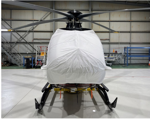
Airbus EC-135 Bubble Cover (with Wire Strike)