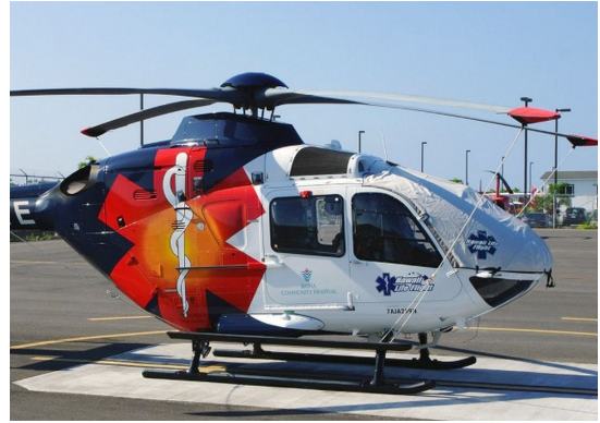
Eurocopter EC-135 Windshield/Skylight Cover