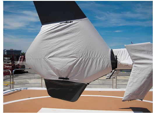
EC-135 Tailfan Cover and Tailboom Stabilizer Cover