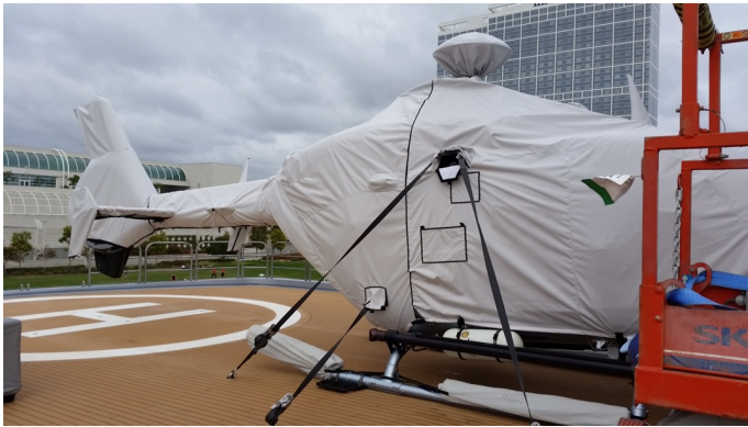
EC-135 Full Cover Set

The Tailboom Cover details vary by model, but generally the helicopter tail boom cover encloses the tail boom from the "bottleneck" to the aft end. They usually also cover the horizontal stabilizers, and are custom made to allow for antennae, lights, and other protrusions. They attach with straps underneath the tail boom. Covers for the vertical and horizontal stabilizers are also available separately. Specific information for each model is available on request.