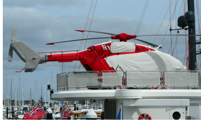
Eurocopter EC-135 Bubble, Engine, Rotor Hub, Tail Surfaces Covers