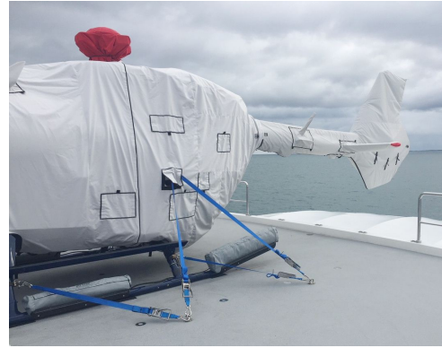
Eurocopter EC-145 D2 Main Body Cover, Tailboom/Fenestron Cover