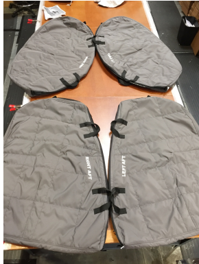
MD 500D Padded Door Bags

**Padded Door Bags* are designed to provide portable protection of the doors when they are removed from the aircraft. They are padded to moderate thickness, zippered closed, and have sturdy carry handles for easy transport.