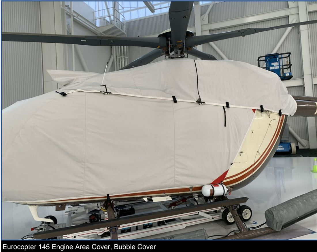
Eurocopter 145 Engine Area Cover, Bubble Cover