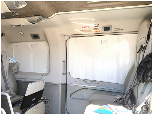
Eurocopter EC-145 Cabin Heatshields

Heatshields are interior sunshades for an aircraft's windows or canopy glass. The product is a unique composite of closed-cell foam with a silver mylar finish. The semi-rigid design is stiff enough to stand along the inside of the windshield using sun visors or window framing. It folds up flat and easily stores in the included storage sleeve. Some designs may require velcro and suction cups. A Heatshield is an excellent short-term remedy for cockpit overheating.