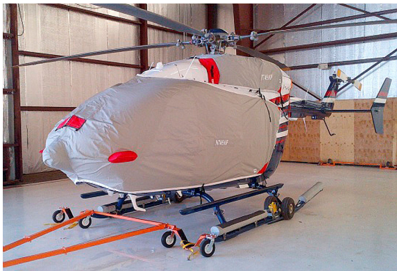
Bubble Cover w/ nose mounted radome & Upper Deck Plugs/Cover