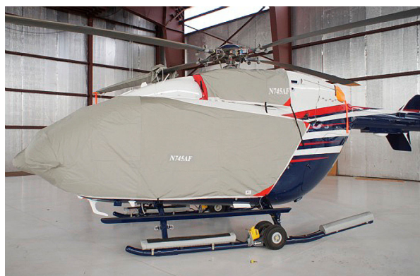
Bubble Cover w/ nose mounted radome, Upper Deck Plugs/Cover

The Engine Inlet Plugs are custom fit for your Airbus Helicopter H145, UH-145, BK-117 D-2, D-3 intakes, made with heavy-duty vinyl material, and stuffed with a single block of sculpted urethane foam. Each plug has a zipper that allows the foam to be removed and dried if necessary. Engine plugs have 'Remove Before Flight' streamers sewn onto the face of the plugs. Most plugs are imprinted with the aircraft registration number in black for an extra charge. Storage bag NOT included. Engine plugs may be inserted after flight when the engine is still warm. Engine Inlet Plugs are commonly referred to as Cowl Plugs, Intake Plugs, Cowl Blocks, Engine Blocks, and Engine Bunges.