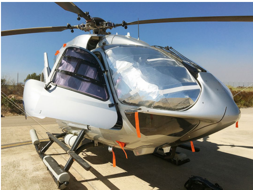
Eurocopter EC-145 Cockpit Heatshields