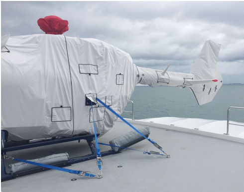
Eurocopter EC-145 D2 Main Body Cover, Tailboom/Fenestron Cover

The Tailboom Cover details vary by model, but generally the helicopter tail boom cover encloses the tail boom from the "bottleneck" to the aft end. They usually also cover the horizontal stabilizers, and are custom made to allow for antennae, lights, and other protrusions. They attach with straps underneath the tail boom. Covers for the vertical and horizontal stabilizers are also available separately. Specific information for each model is available on request.