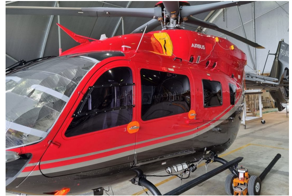
Airbus Helicopter H145D3 Intake Plugs