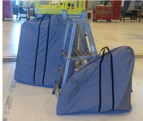
Eurocopter EC-145 Padded Bags for Removable Doors