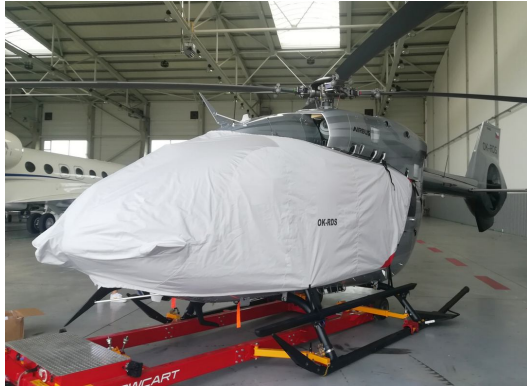
Airbus Helicopter EC-145 Bubble Cover with Radome & Wire Strike

This cover type is made from Silver Acrylic Sunbrella canvas and is 100% lined with a soft and smooth microfiber. Bruce's Custom Covers developed this material combination especially for aircraft protection. The outer material is medium weight and treated for water resistance, UV resistance and anti-static buildup. The inner lining is a very soft and smooth microfiber to prevent scratching. The material is very reflective, and tests show that the cabin interior temperature can be reduced to near-ambient temperature on the hottest of days. It is water, ice and snow repellent, yet breathable to allow moisture to escape from between the cover and the aircraft surface.