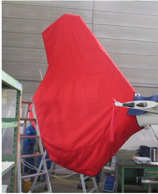
Airbus EC145 Tailfan Housing Fenestron Cover

The Tailboom Cover details vary by model, but generally the helicopter tail boom cover encloses the tail boom from the "bottleneck" to the aft end. They usually also cover the horizontal stabilizers, and are custom made to allow for antennae, lights, and other protrusions. They attach with straps underneath the tail boom. Covers for the vertical and horizontal stabilizers are also available separately. Specific information for each model is available on request.