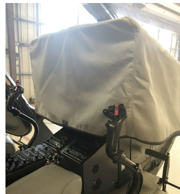
Eurocopter EC-135 Instrument Panel Heatshield Cover