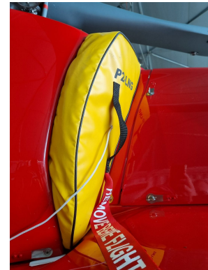
Airbus Helicopter H145D3 Intake Plugs