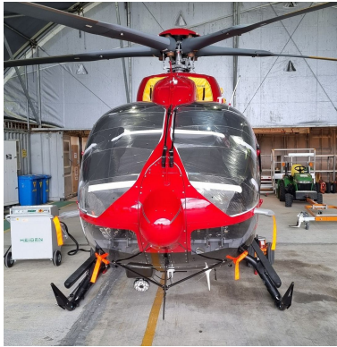
Airbus Helicopter H145D3 Windshield Heatshields, Engine Plugs

The Engine Inlet Plugs are custom fit for your Airbus Helicopter H145, UH-145, BK-117 D-2, D-3 intakes, made with heavy-duty vinyl material, and stuffed with a single block of sculpted urethane foam. Each plug has a zipper that allows the foam to be removed and dried if necessary. Engine plugs have 'Remove Before Flight' streamers sewn onto the face of the plugs. Most plugs are imprinted with the aircraft registration number in black for an extra charge. Storage bag NOT included. Engine plugs may be inserted after flight when the engine is still warm. Engine Inlet Plugs are commonly referred to as Cowl Plugs, Intake Plugs, Cowl Blocks, Engine Blocks, and Engine Bunges.