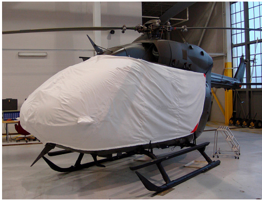
EC-145 Bubble Cover