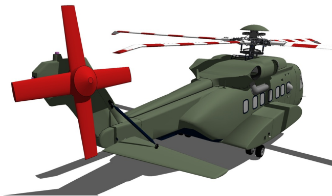
Sikorsky S-92 Tail Rotor Blade and Hub Covers