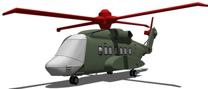
Sikorsky S-92 Windshield/Nose, Blade, Rotor Hub & Tail Rotor Covers

WINTER USE MATERIAL - Made with Solution-Dyed Polyester fabric, this option is intended for seasonal use to aid in deicing, rain mitigation, or for occasional travel. The material is lighter and more compact, but more susceptible to UV damage and may have a shorter useful life if used continuously outside than the all-year use material.