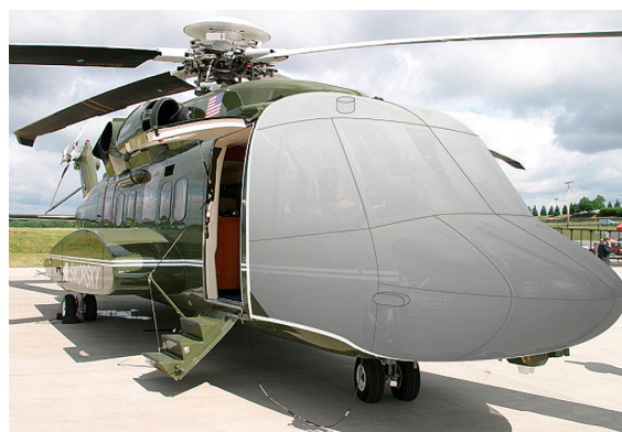
Sikorsky S-92 Windshield/Nose Cover (illustration)