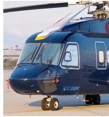
Sikorsky S-92 Cockpit HeatShields