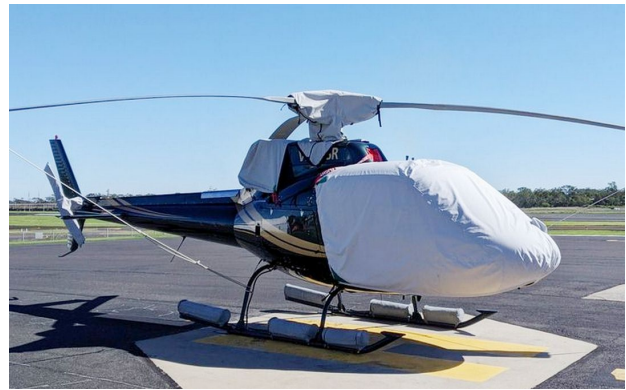
AS350 Bubble, Main Rotor, Intake & Tail Rotor Covers