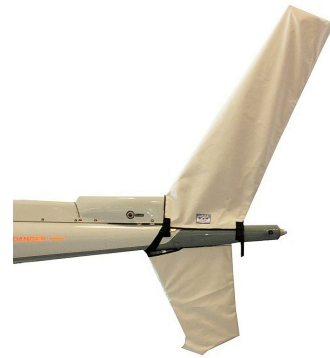
AS350B3 Vertical Stabilizers cover