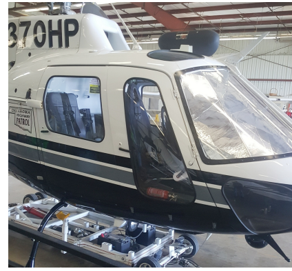
Aerospatiale AS350 Astar, Ecureuil, Esquilo, Fennec Windshield Heatshields