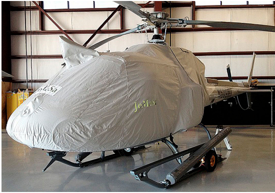
Eurocopter AS350 B3 Main Body Cover, Squirrel Cheeks

water resistance, UV resistance and anti-static buildup. The inner lining is a very soft and smooth microfiber to prevent scratching. The material is very reflective, and tests show that the cabin interior temperature can be reduced to near-ambient temperature on the hottest of days. It is water, ice and snow repellent, yet breathable to allow moisture to escape from between the cover and the aircraft surface.