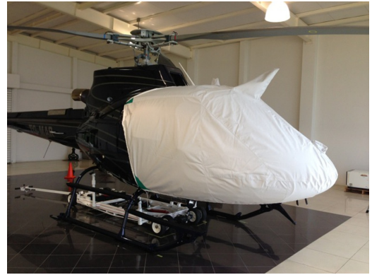
AS350 Bubble Cover