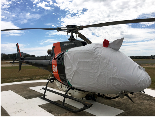
Airbus Helicopter Bubble Cover

water resistance, UV resistance and anti-static buildup. The inner lining is a very soft and smooth microfiber to prevent scratching. The material is very reflective, and tests show that the cabin interior temperature can be reduced to near-ambient temperature on the hottest of days. It is water, ice and snow repellent, yet breathable to allow moisture to escape from between the cover and the aircraft surface.