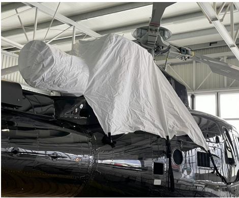
AS350 Intake/Exhaust Cover, test fit cover

WINTER USE MATERIAL - Made with Solution-Dyed Polyester fabric, this option is intended for seasonal use to aid in deicing, rain mitigation, or for occasional travel. The material is lighter and more compact, but more susceptible to UV damage and may have a shorter useful life if used continuously outside than the all-year use material.