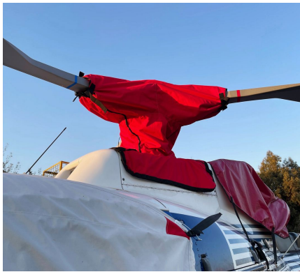
A350 MAIN ROTOR HUB COVER w/skirt

WINTER USE MATERIAL - Made with Solution-Dyed Polyester fabric, this option is intended for seasonal use to aid in deicing, rain mitigation, or for occasional travel. The material is lighter and more compact, but more susceptible to UV damage and may have a shorter useful life if used continuously outside than the all-year use material.