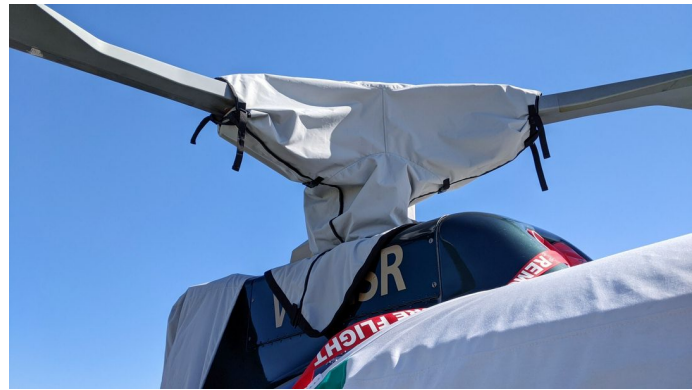
AS350 Main Rotor & Intake Covers