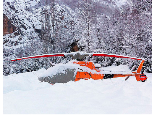
AS350 Bubble Cover, Insulated Main & Tail Rotor Covers, Blade Covers with tie-down detail