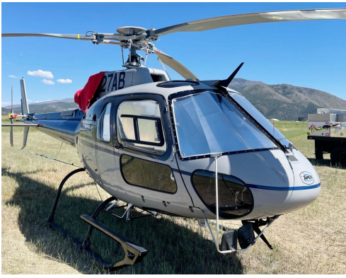
Eurocopter AS350-B3 Cabin HeatShields, Intake/Exhaust Cover