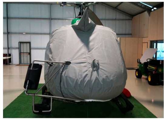
AS350 Bubble Cover with Wire Strike and Cargo Mirror