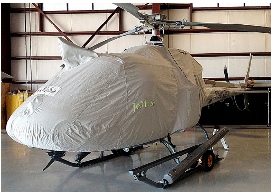
Eurocopter AS350 B3 Main Body Cover, Squirrel Cheeks