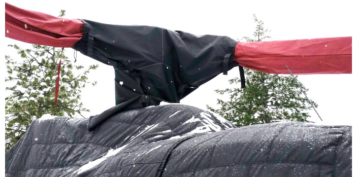
AS355 Bubble Cover w/ Cargo Mirror, Blade Tie-downs, Insulated Engine, Insulated Main Rotor Hub and Insulated Tail Rotor Covers