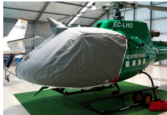
AS350 Bubble Cover with Wire Strike and Cargo Mirror