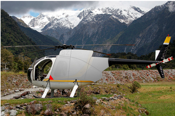
Engine Cover (illustration)