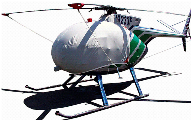
Hughes 500C Bubble Cover with Intake Add-on, Blade Tie-downs

WINTER USE MATERIAL - Made with Solution-Dyed Polyester fabric, this option is intended for seasonal use to aid in deicing, rain mitigation, or for occasional travel. The material is lighter and more compact, but more susceptible to UV damage and may have a shorter useful life if used continuously outside than the all-year use material.