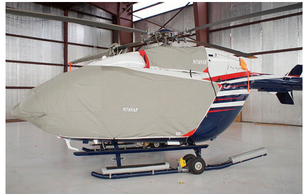
Upper Deck Plugs/Cover, extended to cover aft intake vents Bubble Cover w/ nose mounted radome, Upper Deck Plugs/Cover