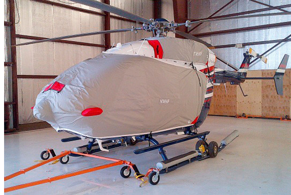
Bubble Cover w/ nose mounted radome & Upper Deck Plugs/Cover