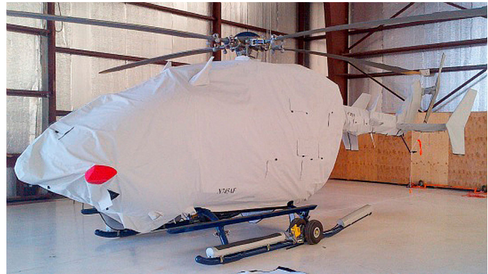
Main Body (also covers bottom), Tailboom, Vertical Pylon, Stabilizers and Tail Rotor Covers