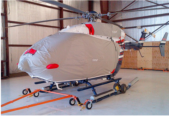
Bubble Cover w/ nose mounted radome & Upper Deck Plugs/Cover

Covers developed this material combination especially for aircraft protection. The outer material is medium weight and treated for water resistance, UV resistance and anti-static buildup. The inner lining is a very soft and smooth microfiber to prevent scratching. The material is very reflective, and tests show that the cabin interior temperature can be reduced to near-ambient temperature on the hottest of days. It is water, ice and snow repellent, yet breathable to allow moisture to escape from between the cover and the aircraft surface.