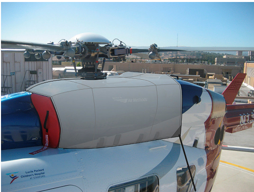
Upper Deck Plugs/Cover, extended to cover aft intake vents

The Engine Inlet Plugs are custom fit for your Airbus Helicopter UH-72A intakes, made with heavy-duty vinyl material, and stuffed with a single block of sculpted urethane foam. Each plug has a zipper that allows the foam to be removed and dried if necessary. Engine plugs have 'Remove Before Flight' streamers sewn onto the face of the plugs. Most plugs are imprinted with the aircraft registration number in black for an extra charge. Storage bag NOT included. Engine plugs may be inserted after flight when the engine is still warm. Engine Inlet Plugs are commonly referred to as Cowl Plugs, Intake Plugs, Cowl Blocks, Engine Blocks, and Engine Bungs.