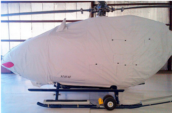
Eurocopter EC-145 Main Body Cover, also covers the bottom belly

Covers developed this material combination especially for aircraft protection. The outer material is medium weight and treated for water resistance, UV resistance and anti-static buildup. The inner lining is a very soft and smooth microfiber to prevent scratching. The material is very reflective, and tests show that the cabin interior temperature can be reduced to near-ambient temperature on the hottest of days. It is water, ice and snow repellent, yet breathable to allow moisture to escape from between the cover and the aircraft surface.