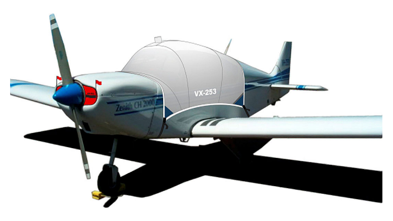
AMD Alarus CH2000 Std Canopy Cover & Engine Plugs (Illustration)