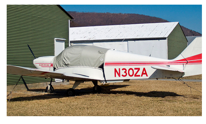
Alarus CH2000 Canopy Cover

This cover type is made from Silver Acrylic Sunbrella canvas and is 100% lined with a soft and smooth microfiber. Bruce's Custom Covers developed this material combination especially for aircraft protection. The outer material is medium weight and treated for water resistance, UV resistance and anti-static buildup. The inner lining is a very soft and smooth microfiber to prevent scratching. The material is very reflective, and tests show that the cabin interior temperature can be reduced to near-ambient temperature on the hottest of days. It is water, ice and snow repellent, yet breathable to allow moisture to escape from between the cover and the aircraft surface.