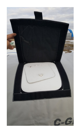
Alarus CH-2000 Insulated Engine Cover

This cover type is made from Silver Acrylic Sunbrella canvas and is 100% lined with a soft and smooth microfiber. Bruce's Custom Covers developed this material combination especially for aircraft protection. The outer material is medium weight and treated for water resistance, UV resistance and anti-static buildup. The inner lining is a very soft and smooth microfiber to prevent scratching. The material is very reflective, and tests show that the cabin interior temperature can be reduced to near-ambient temperature on the hottest of days. It is water, ice and snow repellent, yet breathable to allow moisture to escape from between the cover and the aircraft surface.