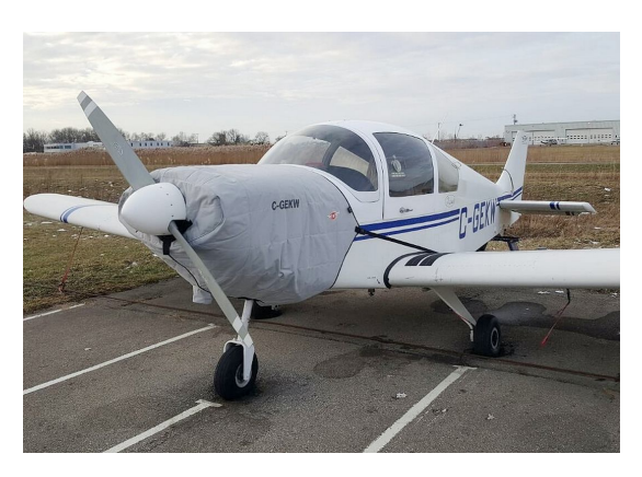
Alarus CH-2000 Insulated Engine Cover