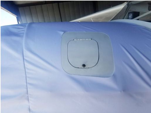
Kitfox Engine Cover, "Radial Cowl" type, test fit