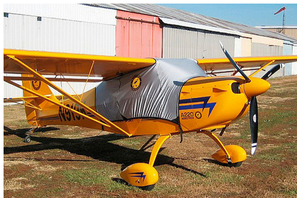
Aerotrek A220 Fitted Hangar Dust Cover