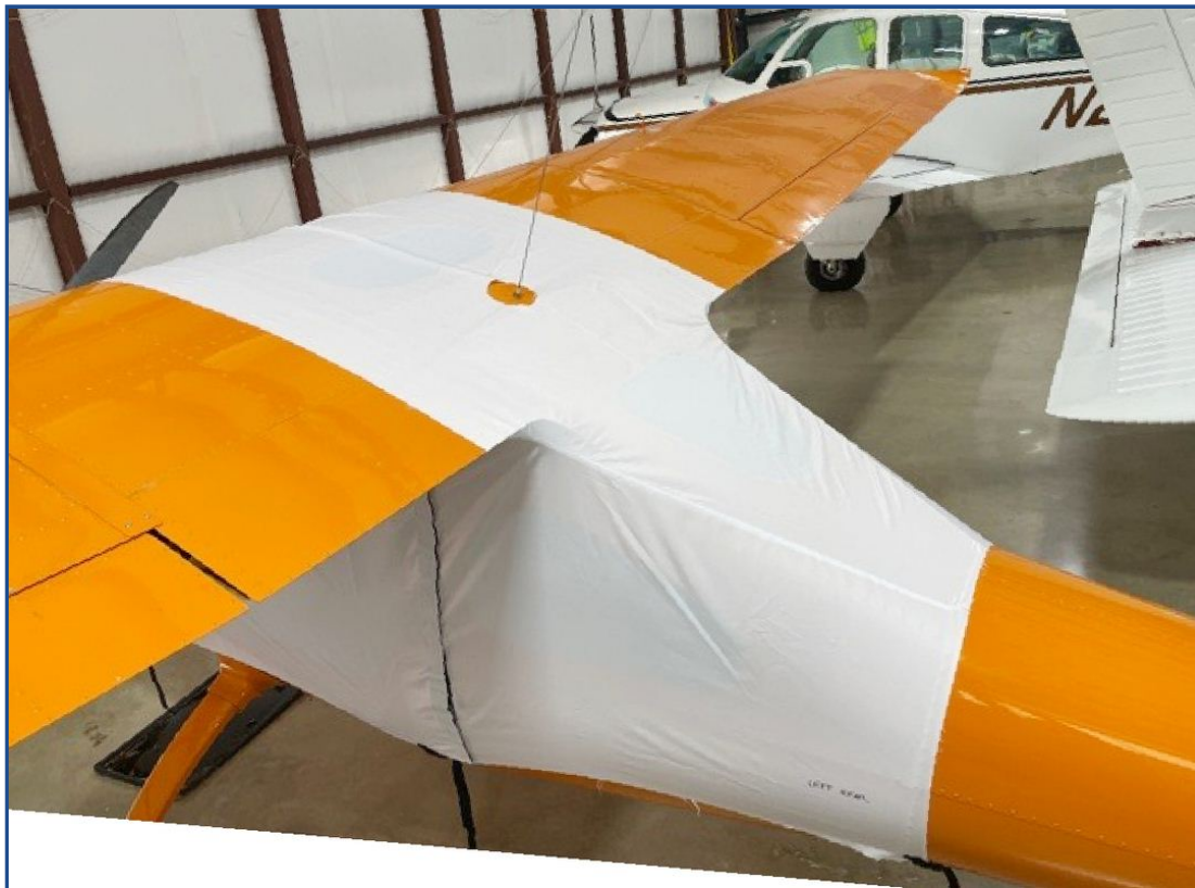
Aeromarine Merlin Over-Top Canopy Cover, test fit cover