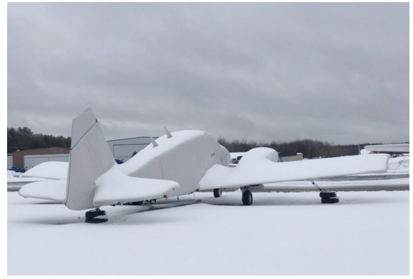
Piper Apache (Geronimo) Full Cover Set