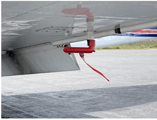
Piper Aztec Pitot Cover