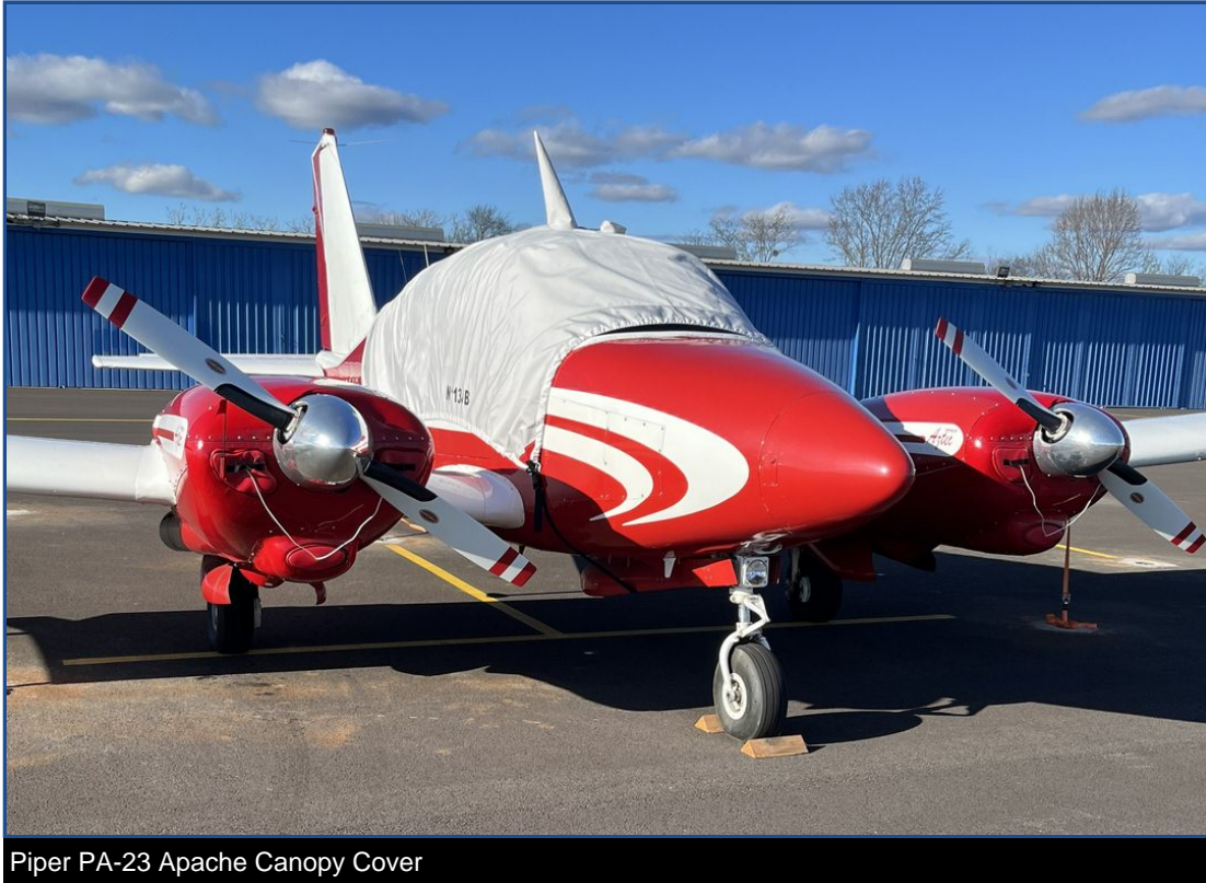
Piper PA-23 Apache Canopy Cover