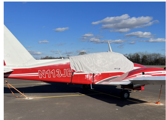
Piper PA-23 Apache Canopy Cover