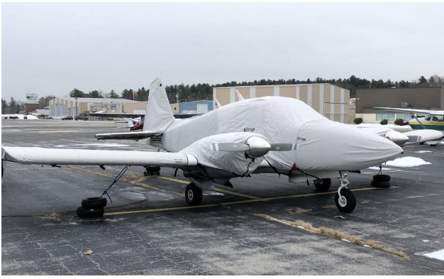
Piper PA-23 Apache Geronimo Extended Canopy Cover