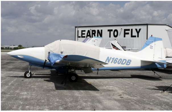
Piper Apache/Geronimo Canopy Cover