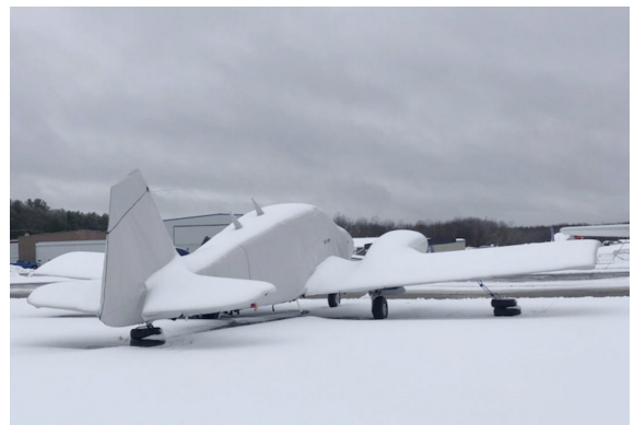
Piper Apache (Geronimo) Full Cover Set