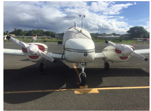
ENGINE PLUGS PREVENT BIRD NEST FOD. Piper Saratoga Engine Cowling Bird's Nest Piper Apache Engine Plugs, Prop Covers