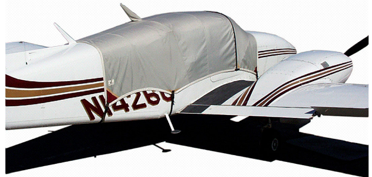
Standard Aztec Canopy Cover