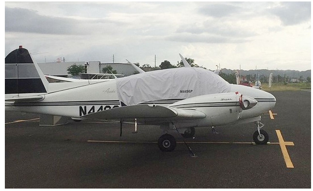
Piper PA-23-160 Apache Belly Strap Type Canopy Cover