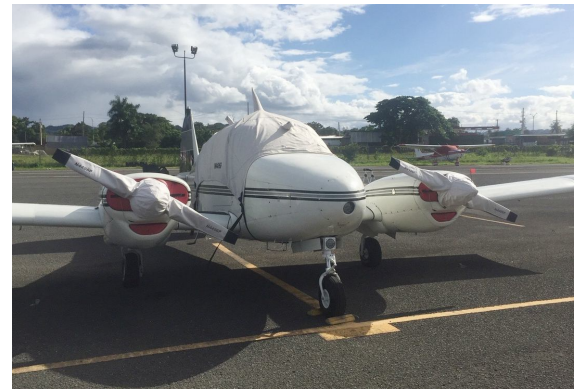
Piper Apache Engine Plugs, Prop Covers