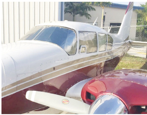
Piper Aztec HeatShield Set