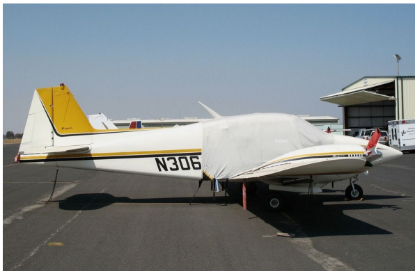
Piper Apache Geronimo Extended Canopy Cover

This cover type is made from Silver Acrylic Sunbrella canvas and is 100% lined with a soft and smooth microfiber. Bruce's Custom Covers developed this material combination especially for aircraft protection. The outer material is medium weight and treated for water resistance, UV resistance and anti-static buildup. The inner lining is a very soft and smooth microfiber to prevent scratching. The material is very reflective, and tests show that the cabin interior temperature can be reduced to near-ambient temperature on the hottest of days. It is water, ice and snow repellent, yet breathable to allow moisture to escape from between the cover and the aircraft surface.