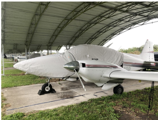
Piper Apache Geronimo Canopy Cover & Nose Cover

This cover type is made from Silver Acrylic Sunbrella canvas and is 100% lined with a soft and smooth microfiber. Bruce's Custom Covers developed this material combination especially for aircraft protection. The outer material is medium weight and treated for water resistance, UV resistance and anti-static buildup. The inner lining is a very soft and smooth microfiber to prevent scratching. The material is very reflective, and tests show that the cabin interior temperature can be reduced to near-ambient temperature on the hottest of days. It is water, ice and snow repellent, yet breathable to allow moisture to escape from between the cover and the aircraft surface.