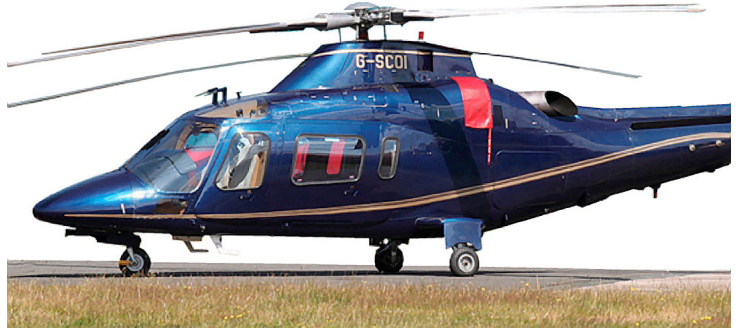
Agusta Power Intake Cover