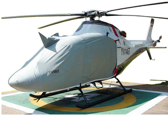
Koala Bubble Cover (with Wire Strike)