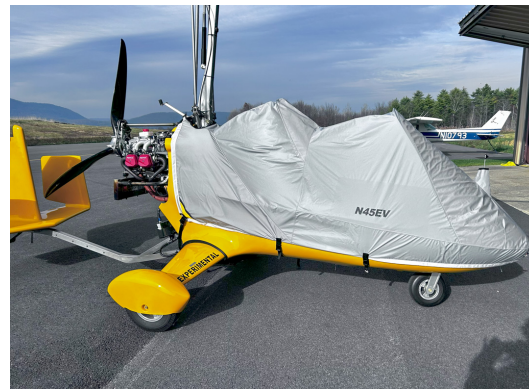
Magni Auto Gyro M16 Cockpit/Nose Cover AR1 American Ranger Gyrocopter Travel Cover, Lightweight Canopy/Nose Cover