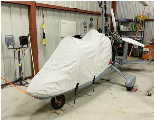
Magni Auto Gyro M16 Cockpit/Nose Cover

Travel Covers are made with Silver Solution-Dyed Polyester fabric and fully lined over the entire cover. The material is lightweight and more compact for easy storage in the aircraft. The polyester material is water resistant, but only intended for occasional use outside. We also have an ultra lightweight material available for fitted hangar dust covers. For daily outdoor use, the non-travel Sunbrella Cover is the best choice.