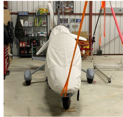
Magni Auto Gyro M16 Cockpit/Nose Cover