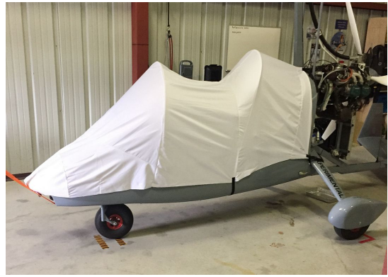
Magni M16 Autogyro Canopy/Nose Cover, test fit cover