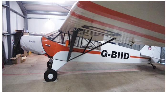
Piper Super Cub Engine Cover