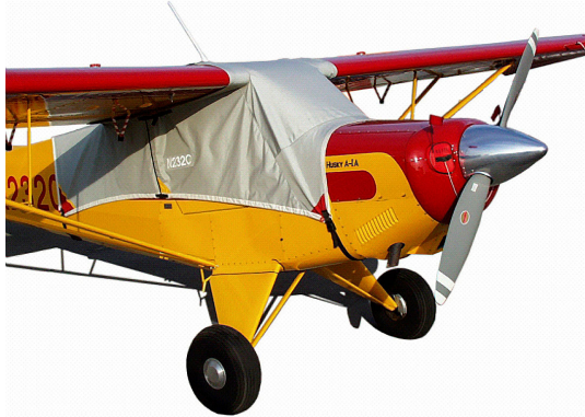
Aviat Husky Canopy Cover & Engine Plugs

Engine Inlet Plugs are custom fit for your Normand Dube Aerocruiser intakes, made with heavy-duty vinyl material, and stuffed with a single block of sculpted urethane foam. Each plug has a zipper that allows the foam to be removed and dried if necessary. Engine plugs have warning flags that are visible from the cockpit or 'remove before flight' streamers sewn onto the face of the plugs. Most plugs are imprinted with the aircraft registration number in black for an extra charge. Storage bag NOT included. Engine plugs may be inserted after flight when the engine is still warm. Engine Inlet Plugs are commonly referred to as Cowl Plugs, Intake Plugs, Cowl Blocks, Engine Blocks, and Engine Bungs.