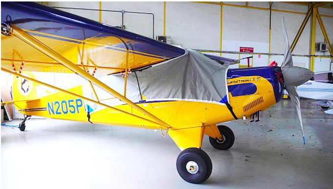
Aviat Husky Canopy & Prop Covers

This cover type is made from Silver Acrylic Sunbrella canvas and is 100% lined with a soft and smooth microfiber. Bruce's Custom Covers developed this material combination especially for aircraft protection. The outer material is medium weight and treated for water resistance, UV resistance and anti-static buildup. The inner lining is a very soft and smooth microfiber to prevent scratching. The material is very reflective, and tests show that the cabin interior temperature can be reduced to near-ambient temperature on the hottest of days. It is water, ice and snow repellent, yet breathable to allow moisture to escape from between the cover and the aircraft surface.