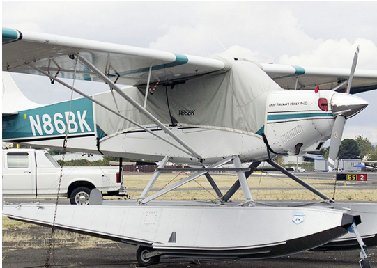
Aviat Husky Canopy Cover and Inlet Plugs

Engine Inlet Plugs are custom fit for your Normand Dube Aerocruiser intakes, made with heavy-duty vinyl material, and stuffed with a single block of sculpted urethane foam. Each plug has a zipper that allows the foam to be removed and dried if necessary. Engine plugs have warning flags that are visible from the cockpit or 'remove before flight' streamers sewn onto the face of the plugs. Most plugs are imprinted with the aircraft registration number in black for an extra charge. Storage bag NOT included. Engine plugs may be inserted after flight when the engine is still warm. Engine Inlet Plugs are commonly referred to as Cowl Plugs, Intake Plugs, Cowl Blocks, Engine Blocks, and Engine Bung.