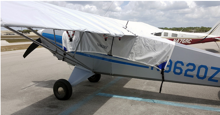
Aviat (Christen) Husky Wing Covers, All Year Use

WINTER USE MATERIAL - Made with Solution-Dyed Polyester fabric, this option is intended for seasonal use to aid in deicing, rain mitigation, or for occasional travel. The material is lighter and more compact, but more susceptible to UV damage and may have a shorter useful life if used continuously outside than the all-year use material.