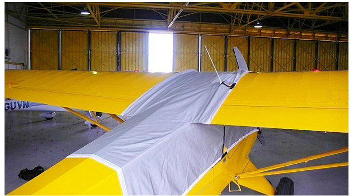
Aviat Husky Canopy Cover