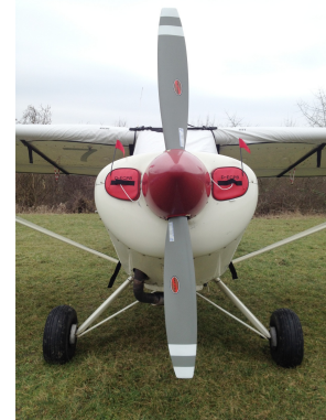
Aviat Husky Engine Plugs, Wing Covers