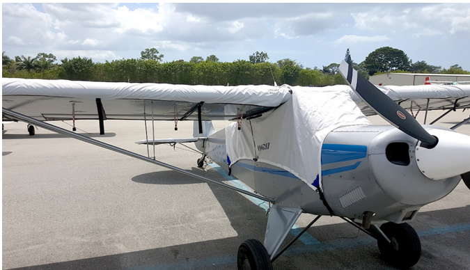
Aviat (Christen) Husky Canopy Cover (Over-The-Top Style)