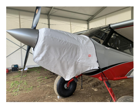
Cub Crafters CC-19 Engine Cover