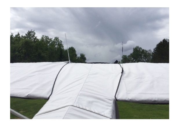
Piper PA-18-150 Super Cub Complete Cover Set

ALL-YEAR USE MATERIAL - Made with Silver Acrylic Sunbrella canvas, the all-year use material is the best option for sun protection and cover longevity. This heavier more durable material is intended for all weather conditions, such as rain and snow or lots of sun.