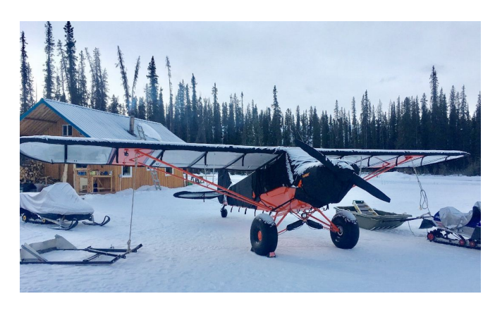
Piper PA-18 Super Cub Canopy Cover (Over-The-Top Style)