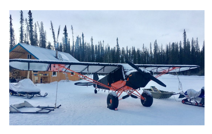
Piper PA-18 Super Cub Canopy Cover (Over-The-Top Style)