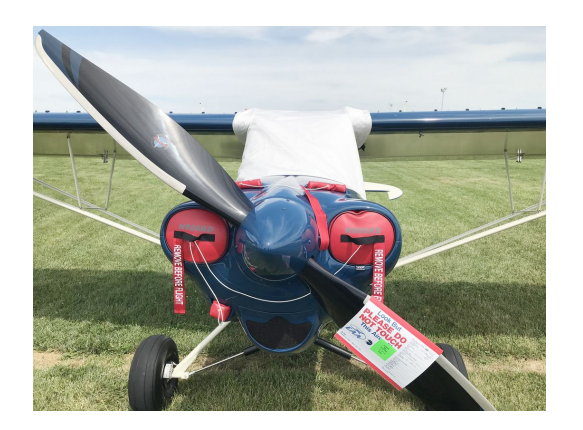
Cubcrafters CC-18 Engine Inlet Plugs