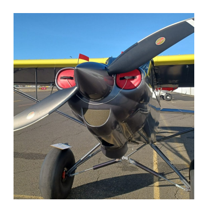
CubCrafters FX-3 Engine Inlet Plugs

Engine Inlet Plugs are custom fit for your Lewaero Ascender intakes, made with heavy-duty vinyl material, and stuffed with a single block of sculpted urethane foam. Each plug has a zipper that allows the foam to be removed and dried if necessary. Engine plugs have warning flags that are visible from the cockpit or 'remove before flight' streamers sewn onto the face of the plugs. Most plugs are imprinted with the aircraft registration number in black for an extra charge. Storage bag NOT included. Engine plugs may be inserted after flight when the engine is still warm. Engine Inlet Plugs are commonly referred to as Cowl Plugs, Intake Plugs, Cowl Blocks, Engine Blocks, and Engine Bungs.