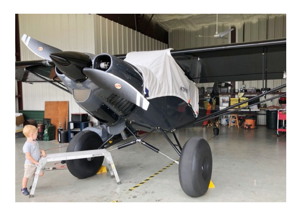
CubCrafters CCK-2000 Over The Top Canopy Cover