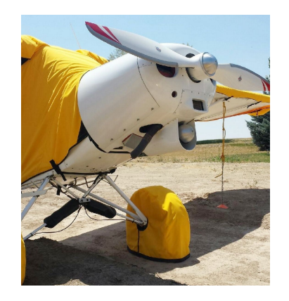
Piper PA-18 Super Cub Extended Canopy Cover, Wing & Tire Covers