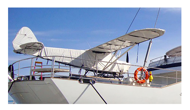
Piper PA-18 Super Cub Complete Cover set