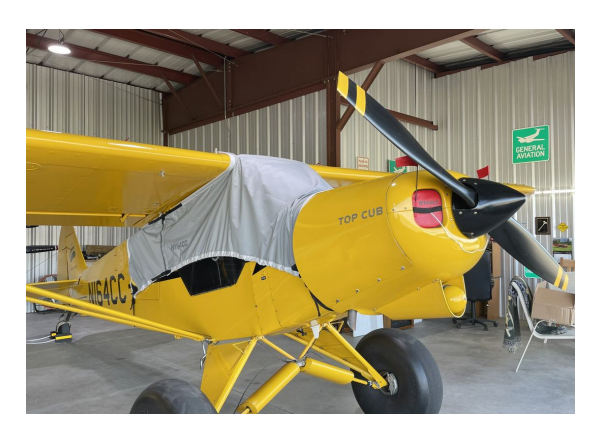
Cub Crafters Carbon Cub Travel Weight Canopy Cover Cub Crafters CC-18 Light Weight Travel Canopy Cover, Engine Plugs