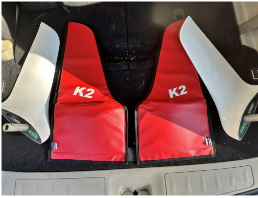
Discus CS Wingtip Pads (Set of 2)