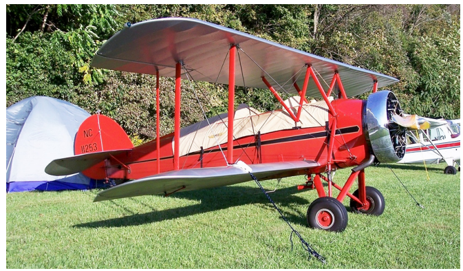
Waco ASO Canopy Cover