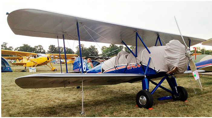
Waco ASO Canopy/Cockpit and Engine Cover