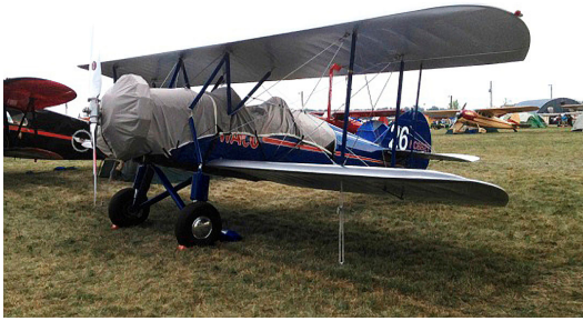
Waco ASO Canopy/Cockpit and Engine Cover