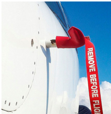
Westwind 1125 Astra Pitot Cover, Heat Resistant Type

The Engine Inlet Plugs are custom fit for your Israel Aircraft Industries Astra (C-38) intakes, made with heavy-duty vinyl material, and stuffed with a single block of sculpted urethane foam. Each plug has a zipper that allows the foam to be removed and dried if necessary. Engine plugs have 'remove before flight' streamers sewn onto the face of the plugs. Most plugs are imprinted with the aircraft registration number in black for an extra charge. Storage bag NOT included. Engine plugs may be inserted after flight when the engine is still warm. Engine Inlet Plugs are commonly referred to as Cowl Plugs, Intake Plugs, Cowl Blocks, Engine Blocks, and Engine Bungs.