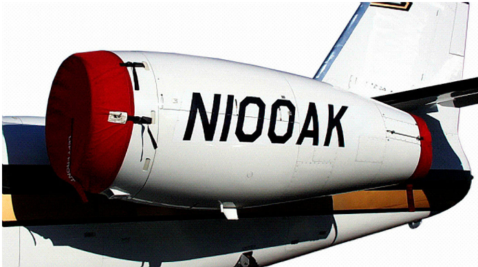
Engine Cover Set for the Astra

The Israel Aircraft Industries Astra (C-38) Bikini Style Engine Covers are a single-piece design using a soft and smooth stretchy fabric. The cover stretches tightly over both the intake and exhaust, installing quickly and easily. These covers are designed to be used as hangar dust covers and have a useful life of approximately one year.