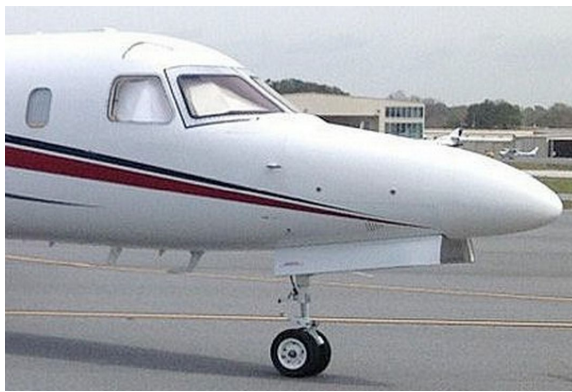
IAI Astra Cockpit Heatshields