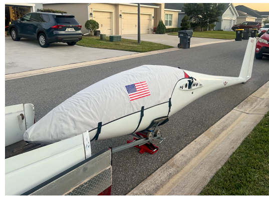
Schleicher ASW-20 Canopy/Nose Cover, ASW-20/20C