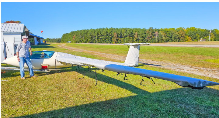
Schleicher ASW-19 Wing Covers, 15 Meter Wingspan, All Year Use