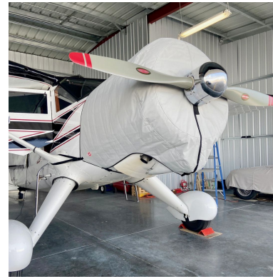
Stinson Reliant V-77, SR, AT-19 Insulated Engine Cover