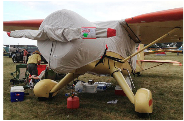
Stinson Reliant Over-the-top Canopy, Engine, and Propeller Cover