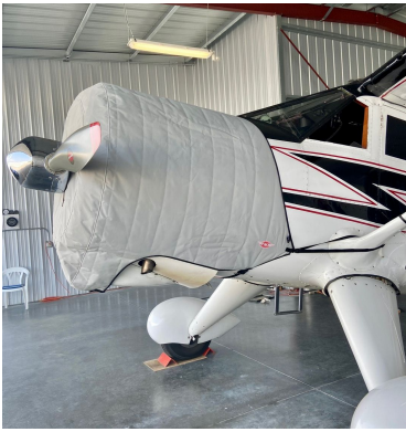
Stinson Reliant V-77, SR, AT-19 Insulated Engine Cover