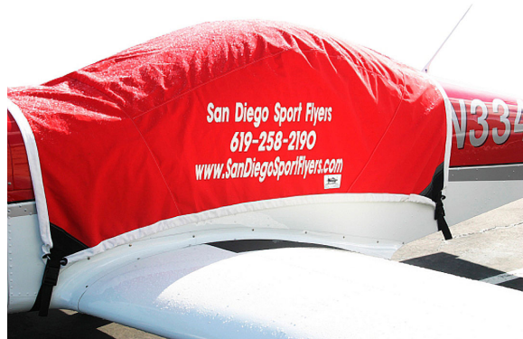
Gobosh Canopy Cover with custom Imprint