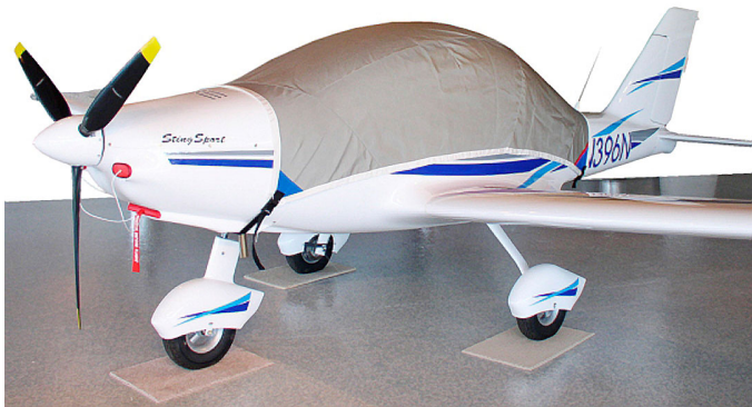
Sting Sport Canopy Cover & Engine Plugs

This cover type is made from Silver Acrylic Sunbrella canvas and is 100% lined with a soft and smooth microfiber. Bruce's Custom Covers developed this material combination especially for aircraft protection. The outer material is medium weight and treated for water resistance, UV resistance and anti-static buildup. The inner lining is a very soft and smooth microfiber to prevent scratching. The material is very reflective, and tests show that the cabin interior temperature can be reduced to near-ambient temperature on the hottest of days. It is water, ice and snow repellent, yet breathable to allow moisture to escape from between the cover and the aircraft surface.