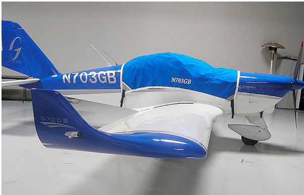
Gobosh Canopy Cover